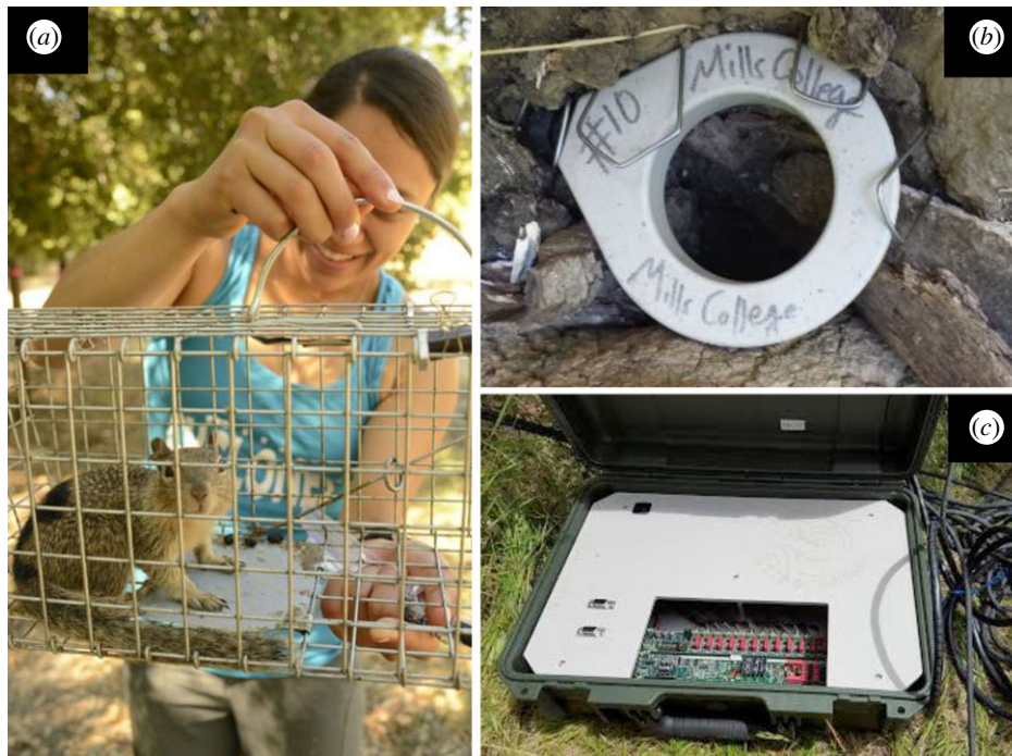
Figure 1. Novel automated-tracking system. (a) Live trapping and release of free-living California ground squirrels allow researchers to provide each individual with a unique fur mark for visual identification during social observations, ear tag for identification during trapping and passive integrated transponder (PIT) tag beneath the skin for detection by the monitoring system. (b) Movements are detected by scanning an individual's PIT tag every time it passed through a secure antenna loop inside of a burrow opening. (c) Data logger (Biomark, Inc., Boise Idaho) records information about the time of day, squirrels' PIT tag ID and burrow location for each movement event. (Online version in colour.)