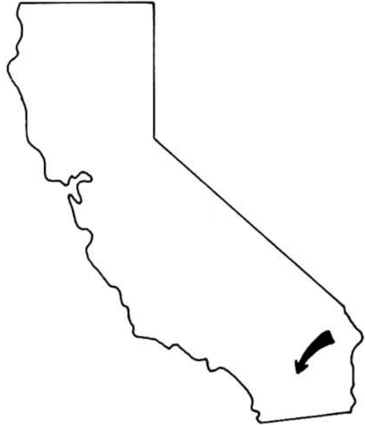
Fig. 1. Location of the Cottonwood Spring cache site (Riv-937).

The cache occurred in a low-roofed rockshelter with two entrances. At the rear of the slightly sloping shelter floor was a large, closely-woven basket inverted over a heavily spalling buffware olla, while to the north, but adjacent to these items, were three spirit sticks standing upright against the rear rockshelter wall. These spirit sticks were buttressed by two large, flat rocks at their bases, while the olla was partially embedded in the rockshelter fill (Fig. 2). In addition, several long nolina ( Nolina sp.) fragments were observed wedged along one side of the rockshelter, while woodrat ( Neotoma sp.) fecal pellets were seen scattered around the cache and within the olla, which, due to holes caused by spalling, had