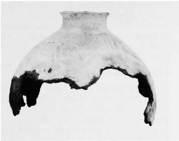
Fig. 5. Upper portion of olla, showing two faint handprints in red paint below the neck. Diameter of mouth 14.5 cm.

rally reddish-buff with erratic fireclouding visible. Two handprints in red paint (right and left) of near-adult size (8 cm. wide by 12 cm. long) occur near the neck of the olla. The interior surface is anvil marked, smoothed, and reddish-brown in color. The interior of the olla base has a whitish-gray surface appearing over the red paste core, which may be either a thick wash or an exfoliating salt scum surface. This surface is crinkled and appears to be flaking off from the underlying core. The clay body of the olla is also spalling heavily where it rested on the rockshelter floor, probably due to salt crystallization within the clay. The core of the olla is a reddish-brown sedimentary clay paste containing fine to medium inclusions of granitic sands. Adhering to the interior of the olla bottom were several patches of gray-black vegetal material, which upon analysis yielded 1 goldfield ( Lasthenia sp.) and 10 possible sage ( Salvia sp.) seeds within an unidentified fibrous matting.