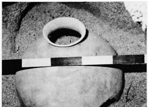
Fig. 3. Upper: Undisturbed placement of the cache in the rock-shelter. A rock weight is on the inverted burden basket. Scale with 10 cm. increments. Center: Inverted iron pan on olla after removal of the rock weight and burden basket. A repair patch is visible on the base of the pan. Lower: Wide-mouthed buffware olla after removal of the iron pan. The red-painted handprints are on the opposite side of the olla (Fig. 5).