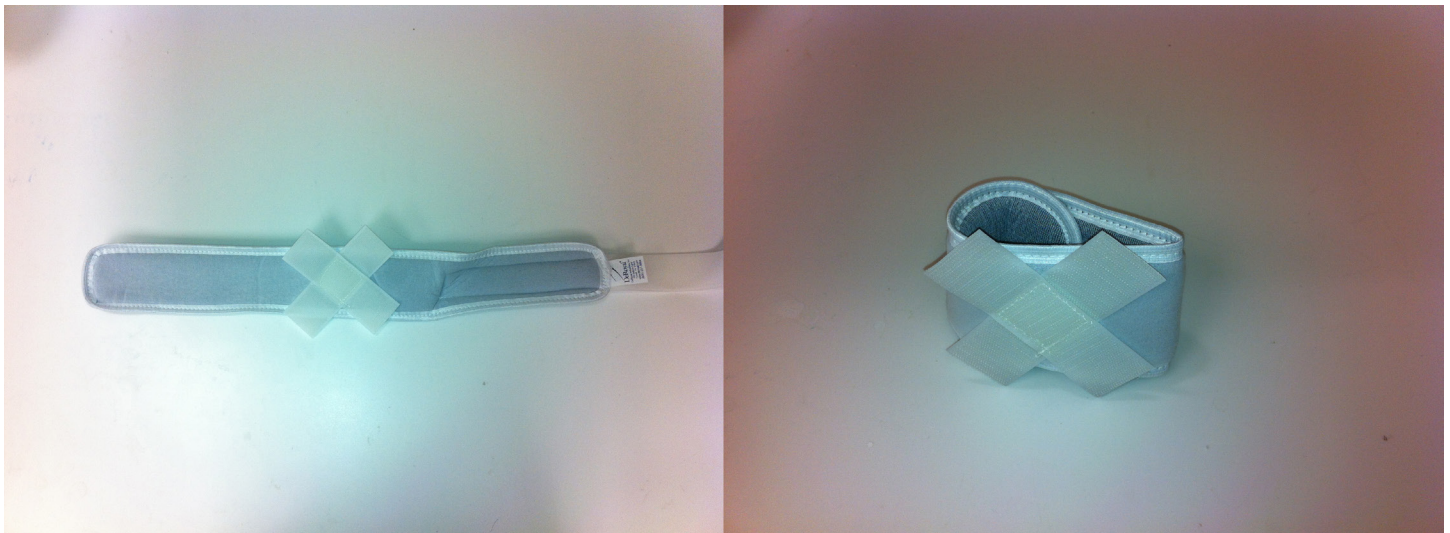
Figure 7. The arm strap and the slightly smaller wrist strap.