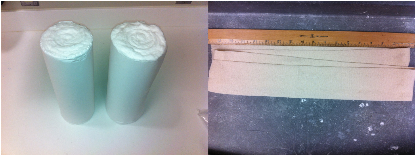
Figure 2. Two 14-inch cotton rolls and 4 feet of 4 inch stockinette are prepared.