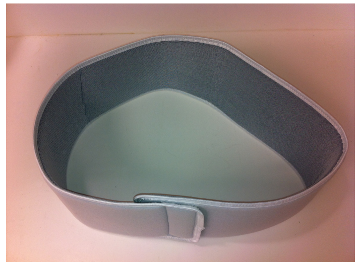
Figure 6. The waist strap.

rotation. 9,10,24 However, larger randomized controlled trials and meta-analyses comparing positions of internal and external rotation for shoulder immobilization following reduction after shoulder dislocation have shown no difference in rates of dislocation recurrence. 2,15,17,26,27 Although a controversial topic, immobilization of the shoulder in a position of external