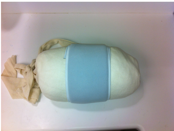
Figure 5. A waist strap is wrapped around the bump and fastened, completing the external rotation bump.