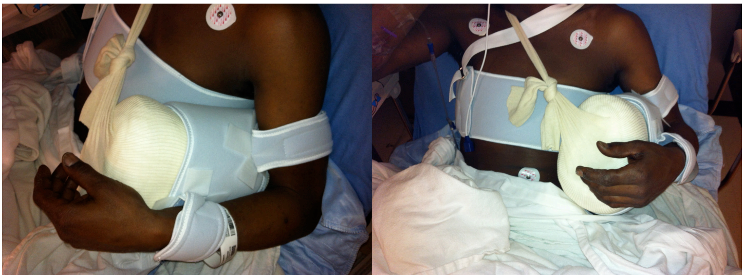
Figure 8. The ideal shoulder immobilization position of 10 degrees of external rotation and 20 degrees of abduction.