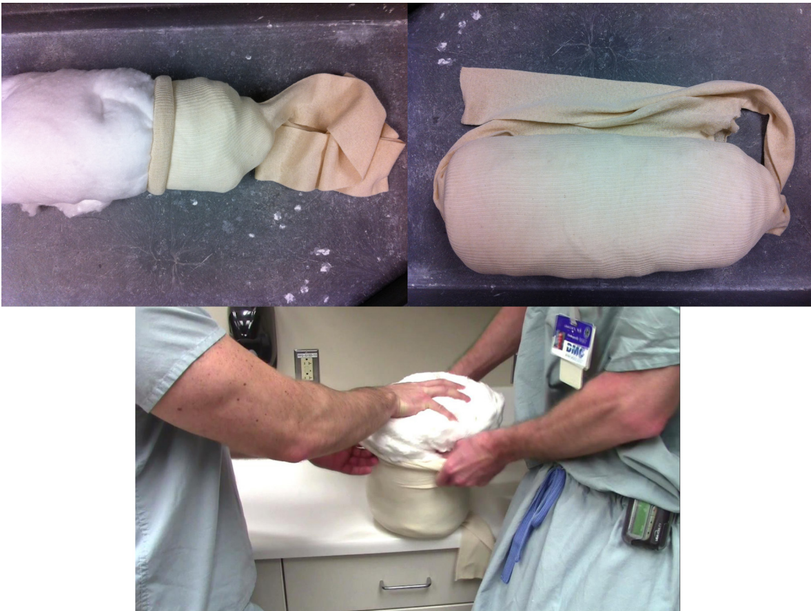
Figure 4. The cotton roll is inserted into the stockinette.