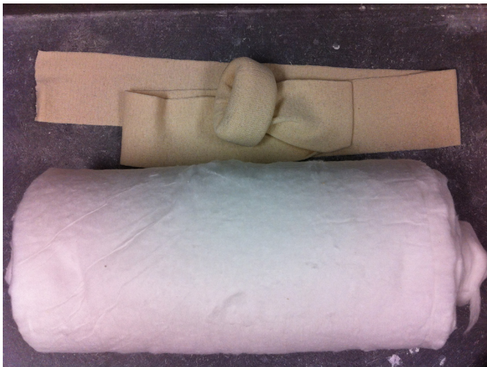
Figure 3. The stockinette is cuffed, to allow for insertion of the cotton roll.