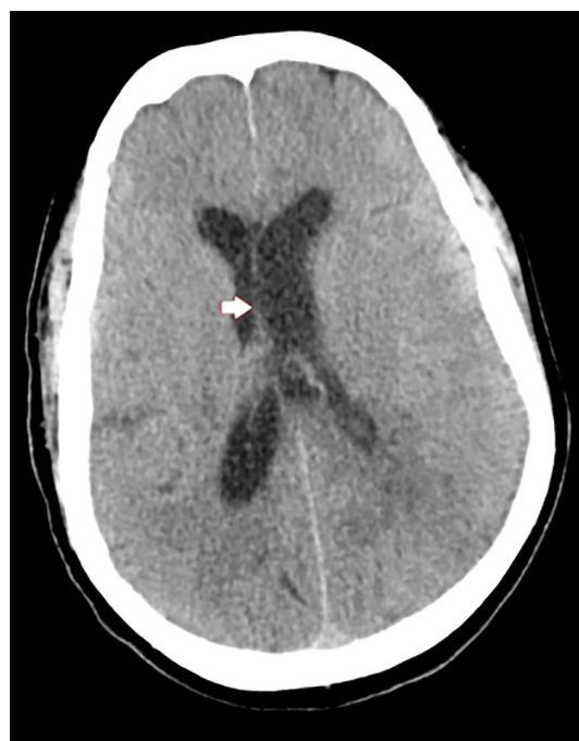
Image 1. Axial computed tomography of the head with intravenous contrast showing mild enlargement of the left lateral ventricle (arrow).

Ventriculitis is an inflammation of the ependymal lining of the cerebral ventricles, usually secondary to infection