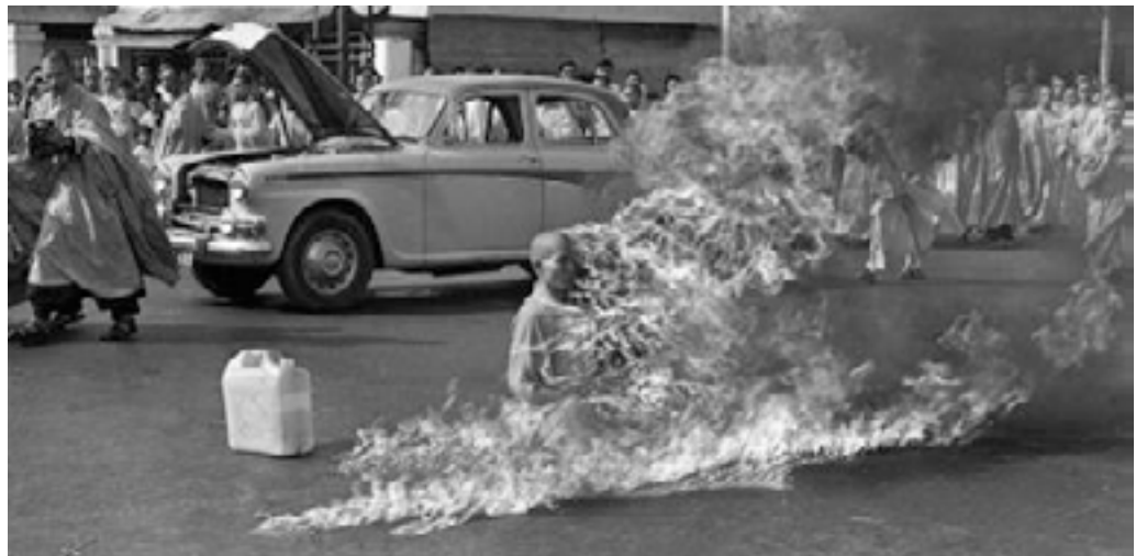
Figure 2. The self-immolation of Thích Quang Đurc. (Browne).

This phenomenon of negating the preservation of personal life is not a modern one; martyrs, for example, have been documented since the beginning of civilization. Humans have long been able to use the power of thought to control their own emotions. However, the first basic theories on emotional output did not reflect this complexity. Rather, they aimed only to organize the pathway by which environmental stimuli are translated into emotions. First, the James-Lange Theory proposed in 1884 uses a person's physiological signals (nail biting, shaking, etc.) to deduce the emotion that will result by arguing that "without the bodily states preceding the perception, the latter would be purely cognitive in form and destitute of emotional warmth" (Lange). In other words, behavioral responses are always followed by emotional tags. The Cannon-Bard Theory proposed in the 1920's, on the other hand, suggests simultaneity of physiological change and emotions. In neurobiological terms, the thalamus receives a nervous impulse and divides this message in two. One signal goes to the cortex to originate subjective experiences like fear, rage, sadness, joy, etc. while the other part goes to the hypothalamus to determine the peripheral neurovegetative changes