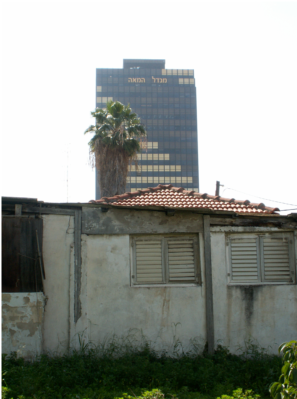
Fig. 2. A photo taken from within the site of Someil, looking in the direction of Ibn Gvirol Street.