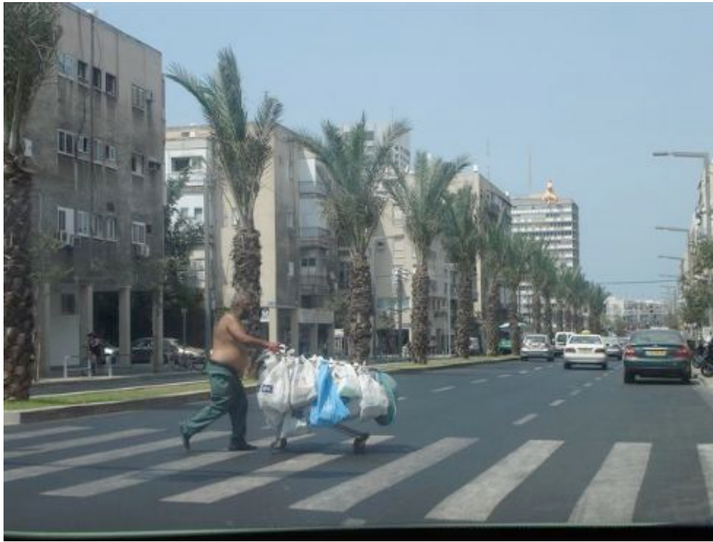
Fig. 4. The renovated and "dignified" Ibn Gvirol Street.