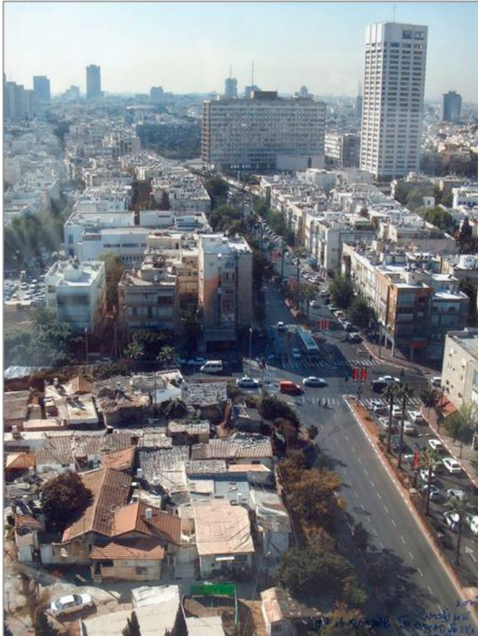
Fig. 1. Bird's eye view of the site of Someil (bottom left corner). Ibn Gvirol Street is crossing the photo, with Tel Aviv city hall in the background.

Oded Haas is grateful to the Azrieli Foundation for the award of an Azrieli Fellowship