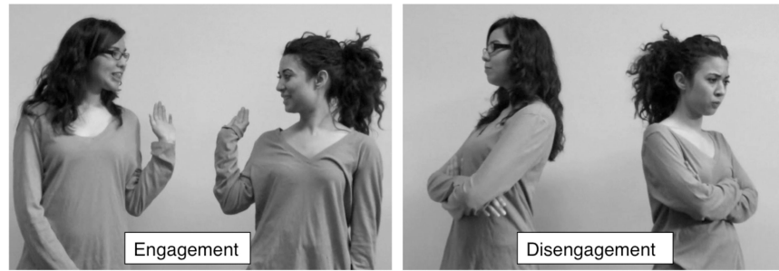
Figure 2. Test trials. This figure displays still images from the end of the videos of each type of test trial. Looking times were recorded to these still images.