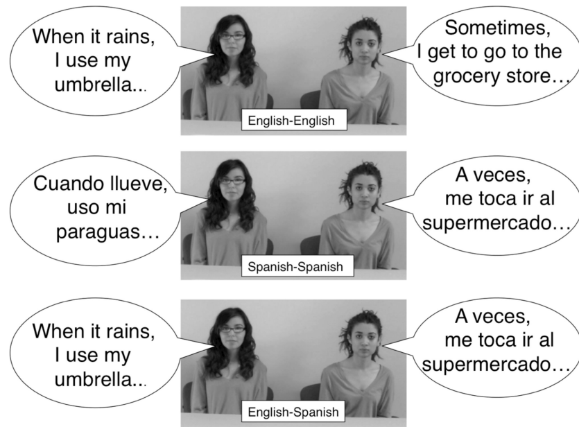
Figure 1. Familiarization conditions. This figure displays still images from videos of the conditions from both studies. The speech bubbles depict the beginning of each actor's vignette. In all familiarization movies the two actors sat together, but never directly interacted, they instead speak one at a time while facing forward. The English-English and English-Spanish conditions were presented in Study 1, and the Spanish-Spanish condition was presented in Study 2.