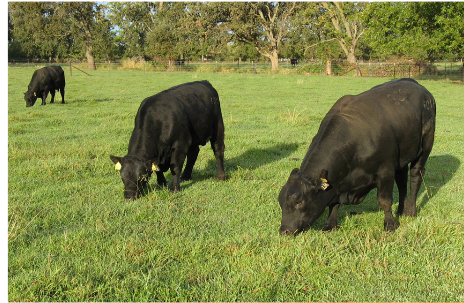
Figure 4. Bulls can consume 25% more forage than a cow. Semen-checking and culling bulls can save needed forage for cows.

Sections in the federal tax code—IRS Code Section 451(e) and 1033(e)—allow for the deferral of capital gains during a drought if cattle are replaced upon drought completion. The decision of which section to use depends on whether a drought designation has been declared in the affected area. In most cases, if beyond-normal culling is necessary, it is likely that a drought disaster has been