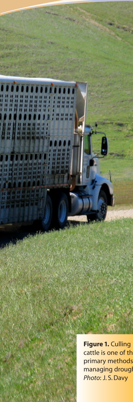
Figure 1. Culling cattle is one of the primary methods for managing drought.