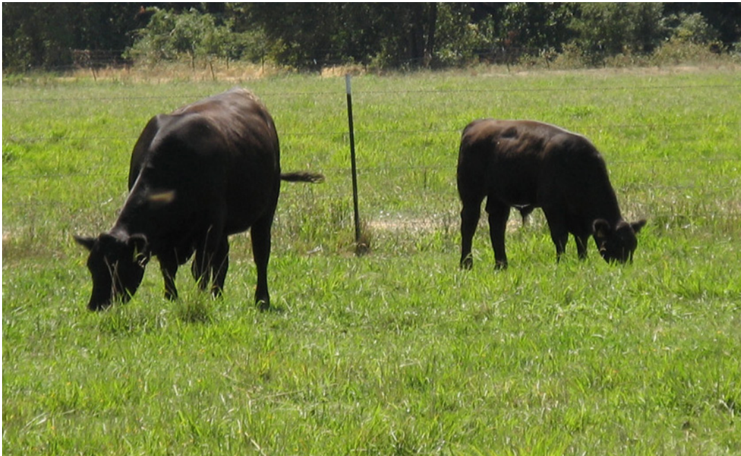
Figure 2. Cow body condition score is the most important factor to consider for conception rate. Cow age, however, is important to consider in calf weaning weight.

Body condition scoring assigns a numeric reference to how much flesh an animal is carrying. Lower body condition scores are assigned to thinner animals, and higher scores are assigned to fleshier animals. To apply body condition scoring as a culling tool,