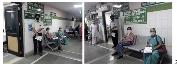
Fig. 2. Social distancing is the new order in the OPD waiting areas with a restricted number of patient attendants. OPD, outpatient department.