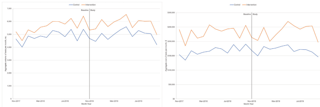
Fig. 3 Aggregate effect of intervention on reference laboratory test-order volume and cost, ambulatory, baseline, and study periods.

order costs was uniformly observed in the inpatient setting, but not the ambulatory setting. Despite these changes, the DIDs of all outcomes, regardless of clinical setting, were statistically insignificant. In addition, there was no significant difference in the DID among different relative cost or TAT groups.