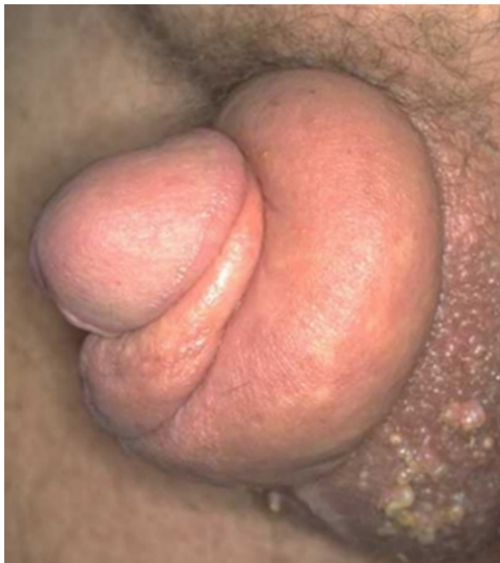
Figure 1. Paraphimosis with non-retractable foreskin and distal swelling (reprinted with permission) 10