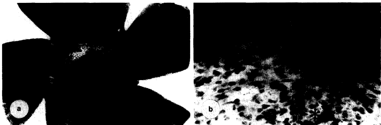
FIG. 3. Light micrographs of a whole mount preparation 15 days postamputation. (a) Low-power photograph of whole mount preparation to show lighter, central wound area. The dark, crescent-shaped region within the wound area is the tip of the blastema which folded over during sample preparation. \times 16 . (b) Higher magnification of the upper right region of the wound area in (a). The nuclei of blastema cells in the wound area (light area) near the boundary with the mature dermis (D) are oriented parallel to the wound edge (i.e., in an arc from left to right). A patch of epidermal cells (*) is visible in the lower right hand corner of the micrograph. \times 170 .

Comparison of the whole mount preparations with their accompanying sectioned limb stumps indicates that the cell-free areas in the whole mount preparations at 5 and 10 days postamputation are occupied by blood clot and cellular debris. Initially this material is extensive