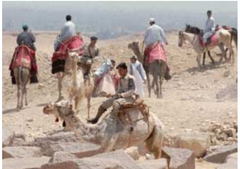
Egyptian policemen patrol on camels beside the Chephren pyramid in Giza in the outskirts of Cairo Friday, April 19, 1996. Security around tourist sites has increased discretely after a suspected Islamic radical group killed 18 Greek tourists in an hotel nearby Thursday.

After the attacks of September 11th, attempts at analysis of any kind were often denigrated as symptoms of cowardice or treason. Pundits and policy makers suggested that to argue that phenomena such as al-Qaeda had social roots was to excuse, or even condone, their apocalyptic actions. As the political scientist Thomas Homer-Dixon pointed out, such arguments are “grade-school non sequiturs” 2 . After all, historians who study Nazism do not justify Auschwitz, and students of Stalinism do not exonerate the perpetrators of the Gulag. Understanding is simply better than the alternative, which is incomprehension. If we fail to grasp the forces behind the attacks of September 11, we will fail to respond wisely.