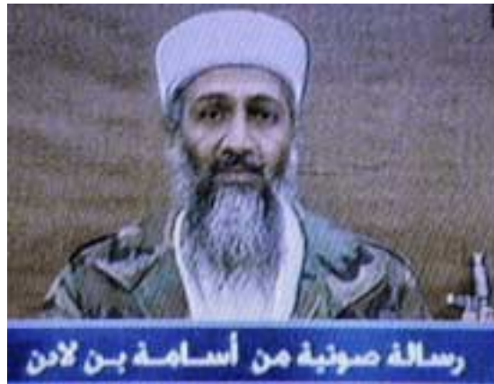
Text at bottom reads "Voice message from Osama bin Laden." Al Jazeera satellite channel broadcast 10/6/02.

transition" in the GCC states: mortality rates have fallen sharply, but fertility rates have fallen only very moderately and remain very high by international standards. Past high rates of population growth fifteen to twenty years ago translate into very rapidly growing labor supplies today. The private sector cannot currently take up the slack in employment creation. The sector is a) too dependent on state largesse and b) relatively too small to do so. Most importantly, however, the countries of the Gulf have limited comparative advantages in non-oil goods or services. Wage rates, seriously inflated by past oil rents and current consumer subsidies, are far too high to compete in low wage activities, but skills are too low to compete in more sophisticated activities.