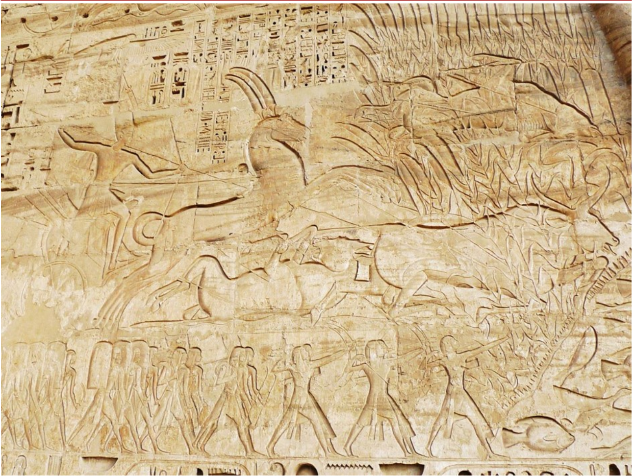
Figure 2. The pharaoh Ramesses III is hunting aurochs on a chariot at the bank of the Nile. He is accompanied by bowmen and armed hunters. A large aurochs is hit by a spear and collapses in the dense reeds at the river margin with its tongue hanging out. Additionally, two juveniles are lying on the ground, one apparently dead with eyes closed and the other one bending its neck up. This relief is located on the back side of the large pylon in the temple of Medinet Habu (Thebes). The whole size of the scene (including Fig. 3 and 4) is approx. 9 x 9 m. The scene was not visible to the public but directed towards the private ritual palace of Ramesses III within the temple area.

tic cattle, the legs of aurochs were long. The whole animal was very tall but Egyptian reliefs do not follow a standard scale. More importantly, it is discernible in the shape of the animal in this relief that the height of the withers almost equals the length of the body – again characteristic of aurochs (Matolcsi 1970; see above).