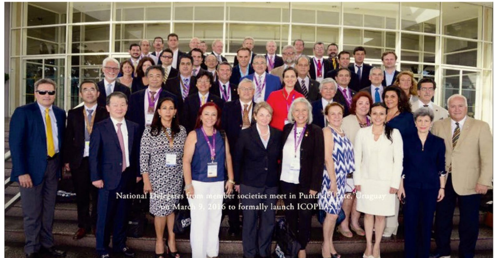
Fig. 1 National delegates from member societies meet in Punta del Este (Uruguay) to formally launch ICOPLAST

Each member country has a representative on the council of national delegates. This council is the ultimate governing body of the society to which the board of directors is accountable. The council of national delegates meets, at a minimum, at least yearly and with the COVID pandemic business has taken place on a zoom platform. Delegates are elected for a 4-year term which is renewable once. The council of delegates come together as a General Assembly which serves as a forum of communication with the individual members of the national societies, but the General Assembly itself has no voting rights or governance of power.