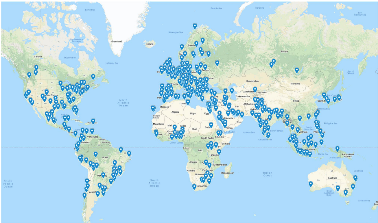
Fig. 2 Over 1400 registrants for the 2021 webinar on lipofilling in breast reconstruction by Roger Khouri (Miami, USA) and Andrzej Piatkowski de Grzymala (Maastricht, the Netherlands).

society meetings previously but the first stand-alone meeting has not occurred.