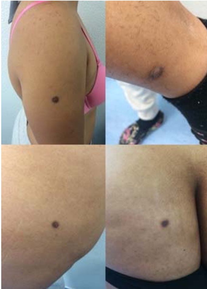
Figure 1. Dermatofibromas. Multiple hyperpigmented papules and nodules distributed all over the skin surface.

nuclear antibodies, and double-stranded DNA antibodies were all negative.