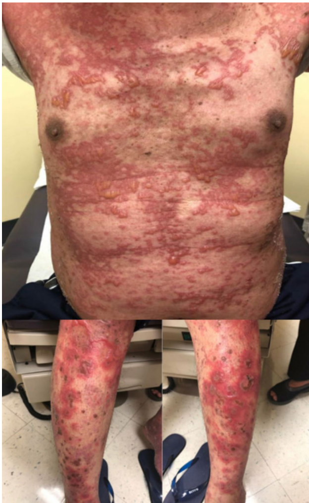
Fig. 1 Osimertinib-induced SJS/TEN in a 63-year-old man with non-small cell lung cancer

The patient was diagnosed with EGFR L858R mutation-positive NSCLC with bone metastasis and received