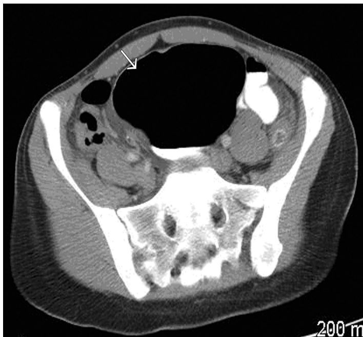
Figure 2. Repeat computed tomography scan showed marked dilatation (arrow) of the cecum up to 10.5 cm with a transition point in the right lower quadrant suspicious for obstruction and cecal volvulus.

recurring abdominal pain. The pain had increased in intensity from the previous day and was now associated with vomiting. Physical exam was significant for tenderness in the right lower quadrant with voluntary guarding. The patient refused a pelvic examination during her first visit, and the exam now failed to reveal any cervical motion tenderness, adnexal masses or tenderness. Complete blood count and chemistry profile were again normal and the patient was discharged once her pain improved with a diagnosis of abdominal pain secondary to ovarian cysts.