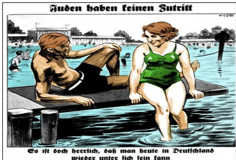
Figure 2. “No entry for Jews: It is really wonderful that today in Germany, one can be among their own again.” 50

sexually inciting elements of Nazism” and noted that for those who fit the prescribed Nazi racial archetypes, new sexual liberties were promised. 48 And indeed a cartoon from August 1937, two years after the implementation of the Nuremberg Laws, depicted the new sexual ease enjoyed by Aryan men in a Germany no longer beset by allegedly lustful Jewish men (figure 2). All of these caricatures in Der Stürmer seem to be designed to invite and gratify the desires of their male readers, playing on a sense of sexual humiliation while also holding out a vision of sexual gratification through overcoming those Jews responsible for German Gentile male impotence. The national impotence that followed the imposition of the Treaty of Versailles, the national humiliation that followed defeat in 1918, and the well-known antisemitic claim that Jews had stabbed the nation in the back seem to collapse here into a more personal sense of sexual impotence, a correlate of what Annette Timm has called “the Nazi project of harnessing emotions to the goals of a racial utopia.” 49 As in much of the other material studied in this article, this material can be simultaneously read in terms of power, control, humiliation, and sexual desire.