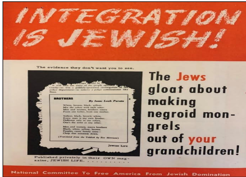
Figure 3. A National States Rights Party handbill warning of Jews' alleged desire to destroy racial difference. 79

As white nationalism moves more and more into the mainstream as Trumpism, this sexual antisemitism has metastasized into the “Great Replacement Theory,” in which Jews are said to be masterminding a population decline of the white race. The fear of racial dilution at work here is also a fear of miscegenation and the “wrong” kinds of sexual contact, since these, along with immigration, are assumed to be the means by which the “replacement” is being carried out. This sexual conspiracy theory has deep roots in white nationalism while also tapping into contemporary fears of migration and rapid social change. It has also become one of the most popular contemporary antisemitic conspiracy theories of the so-called alt-right and increasingly accepted within the GOP. 80