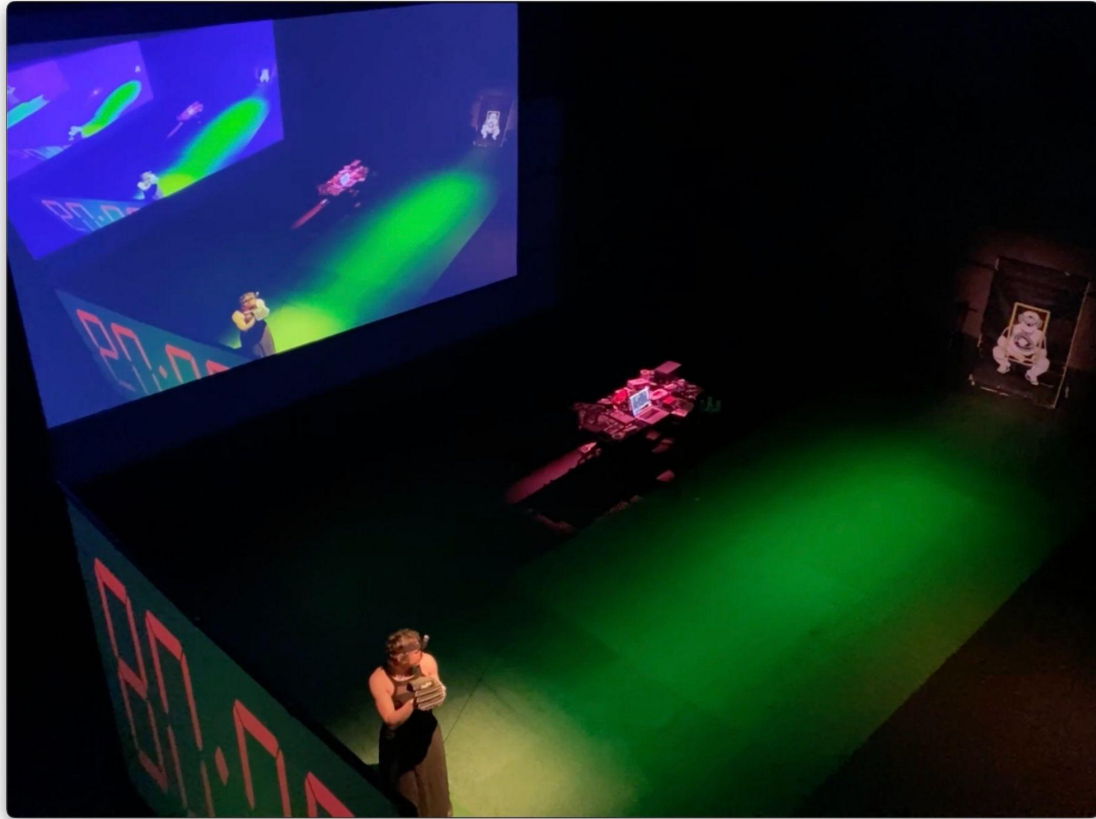
Figure 5.4 - Camera 2 view of performance during Section 2 (shown on Screen 1)