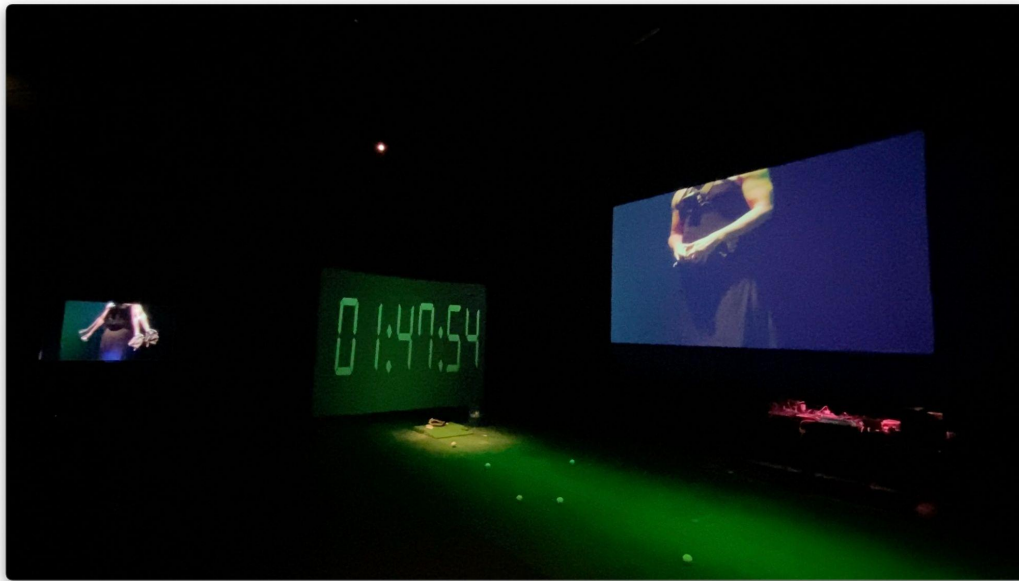
Figure 5.9 - Installation view showing Screen 1, Screen 2, and TV monitor 1