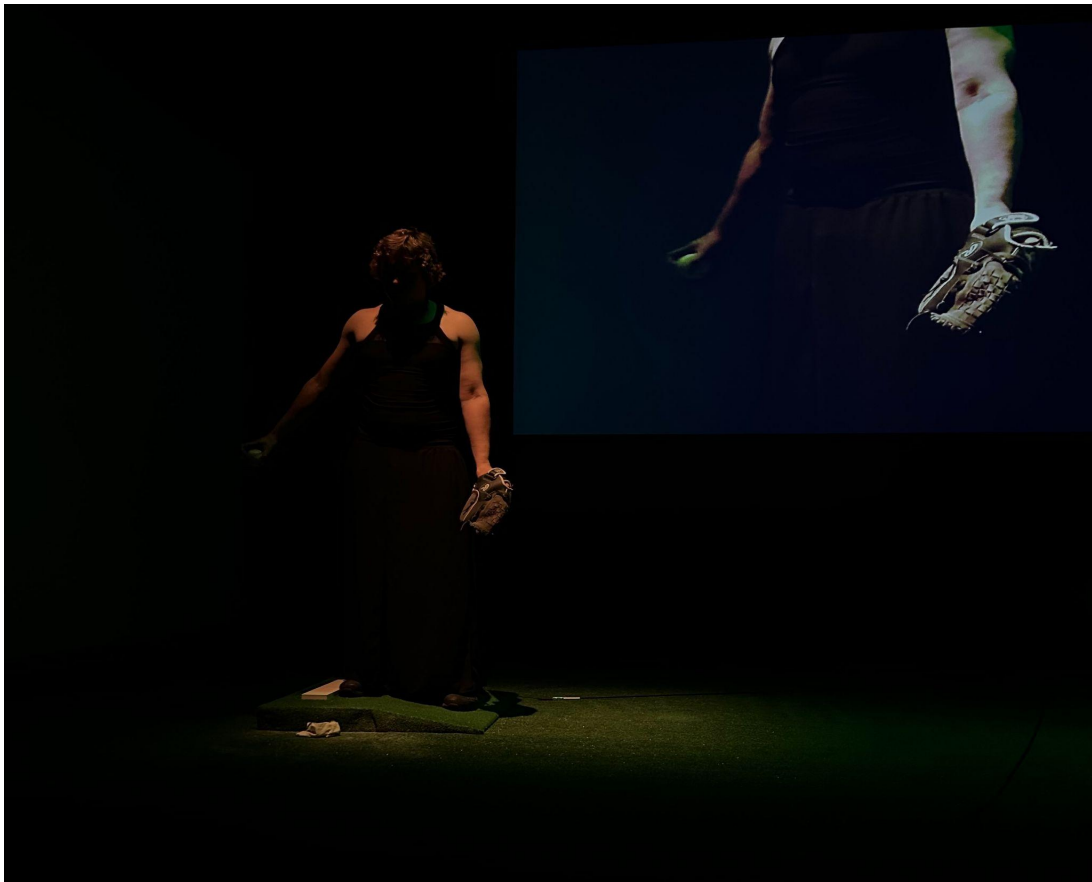
Figure 5.3 - Seated audience view of performance during Section 1, with Screen 1 in background Section 1

The first section lasts for approximately one hour and situates the pitcher within an atmosphere of training. After some preliminary arm stretches, the pitcher establishes a routine of variable length that involves squatting and applying rosin to the ball, performing a pre-pitch ritual, pitching from either the “wind-up” or “stretch” position (roughly two pitches from each position), walking to the tech table to trigger sound and toggle between video angles, walking over to the pitching target to touch it and reinforce it to the wall, and walking back to repeat the process.