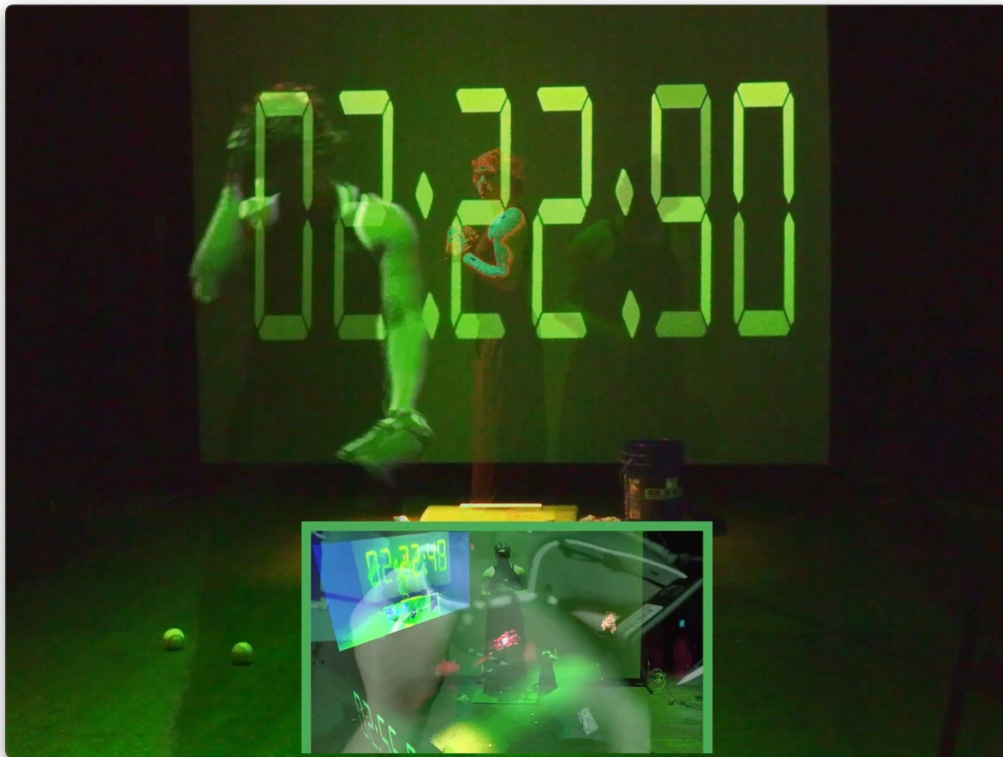
Figure 5.5 - Camera 1 view (with effects) during first subsection of Section 3, shown on Screen 1

As befitting the lack of time for personal embellishment, the improvisatory element of this section is more limited than the first section. Improvisation surfaces in the pitcher's initial reactions to the pitch clock and in how quickly the pitcher is able to adapt to the strictures of this temporality. After the pitcher "masters" the pitch clock, they are in a constant state of throwing and receiving the ball off the bounce from the wall so as not to fall behind the clock; this is a rigid structure that lasts the rest of the section until the tempo of the music slows down.