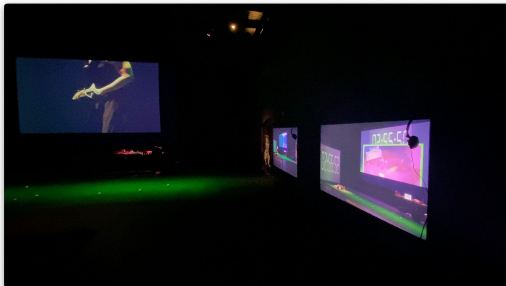
Figure 5.10 - Installation view showing Screen 1 and TV monitors 2 and 3