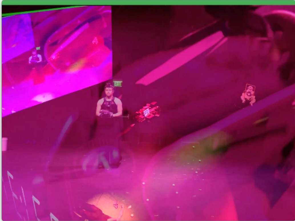
Figure 5.6 - Camera 2 angle superimposed on pre-recorded video, as pitcher lies on ground during second subsection of Section 3 (shown on Screen 1)