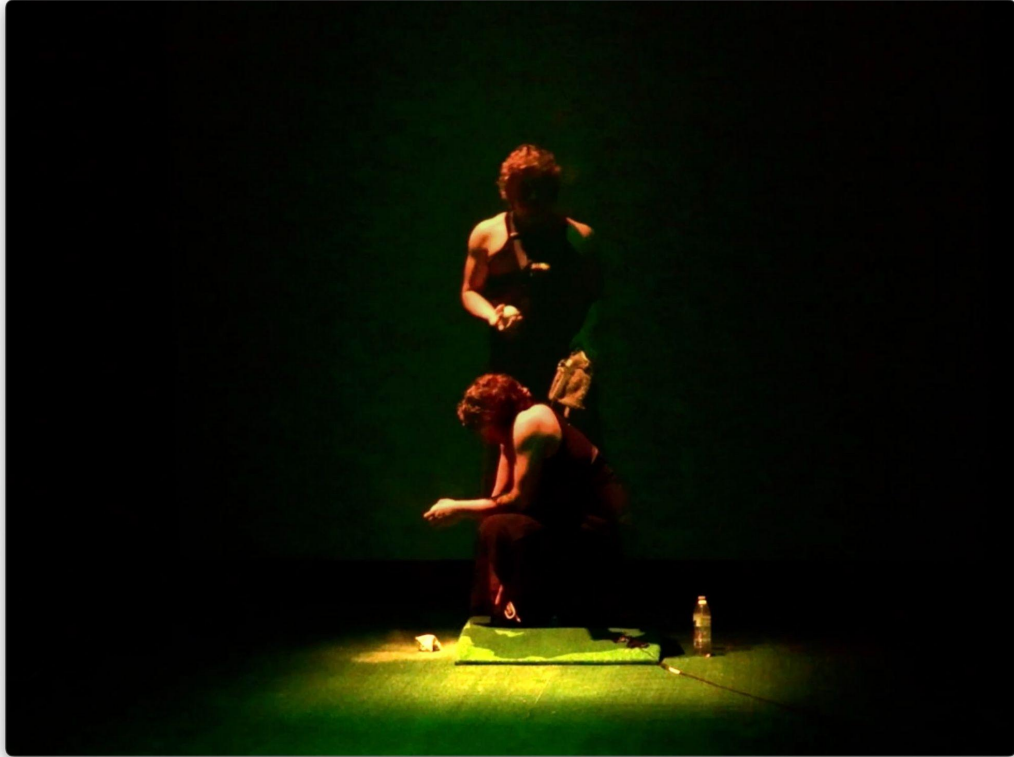
Figure 5.2 - Camera 1 view with superimposed delayed video during Section 1 (shown on Screen 1)