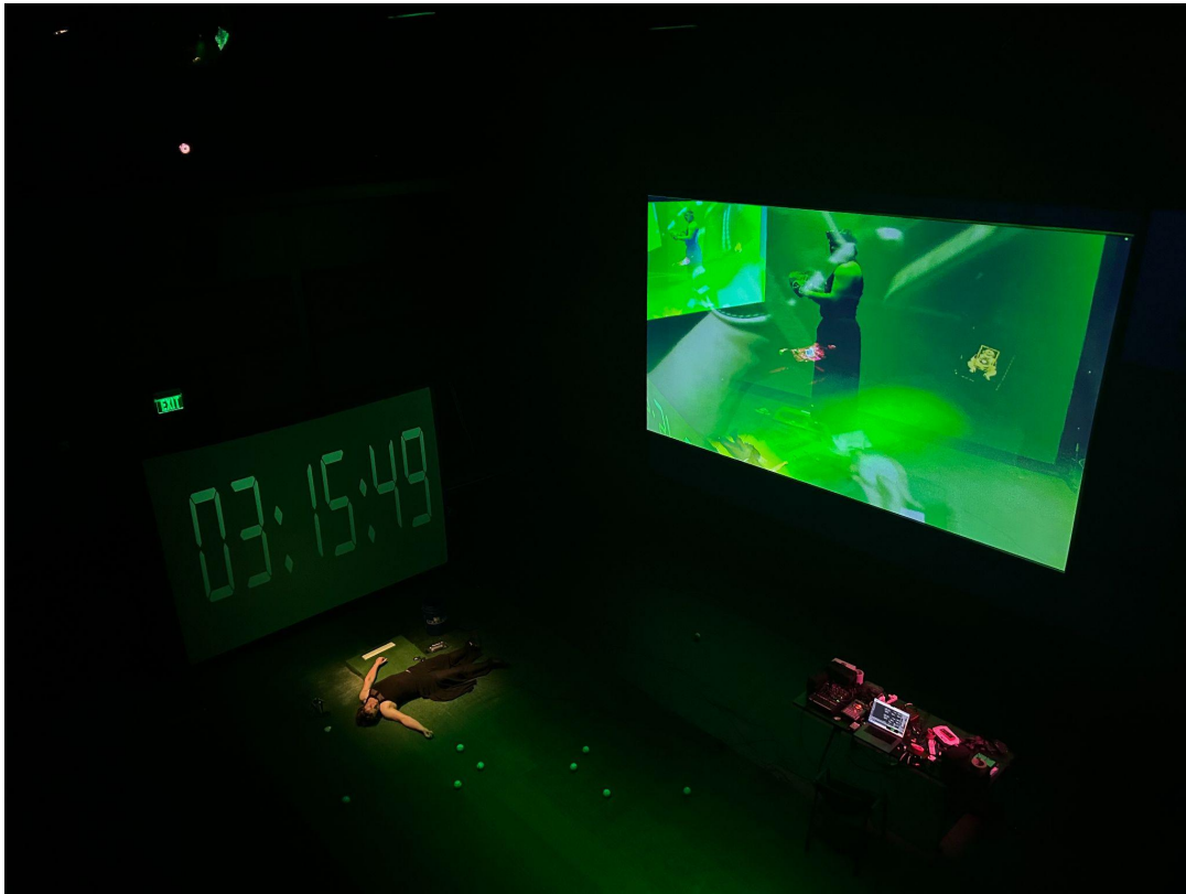
Figure 5.7 - Overhead audience view of second subsection of Section 3, showing Screens 1 and 2

taking time to explore different non-pitching movements (spinning around, stretching their body, walking around the balls they've left on the ground, pouring water over their head).