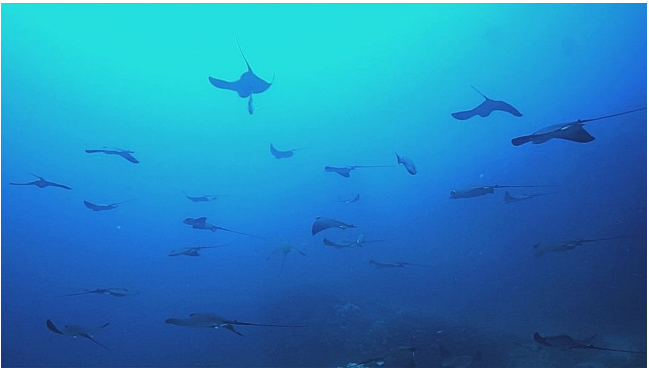
Figure 2. Group of M. aquila individuals observed during the first three sightings and made up of large and small individuals.

and behavior of the species. The presence of threatened species such as M. aquila or species at risk of extinction such as the monk seal implies a greater effort of the MPA Egadi Islands in implementing specific conservation strategies (Caro, 2010). In fact, in the last decade, the island of Marettimo has been at the center of the attention of the international scientific community for the return of the monk seal, a species considered extinct in this area.