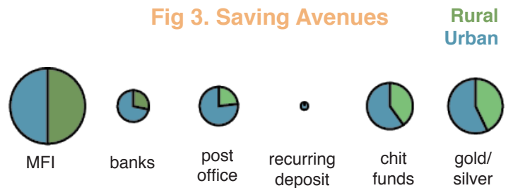
Fig 3. Saving Avenues

To avoid the amount of paperwork and high fees imposed by banks, a large number of both rural and urban women turn to informal means of saving such as participating in local chit funds (30% rural, 45% urban) or investing in gold and silver (45% rural, 60% urban). These investments serve as a hedge against financial crisis and emergencies.