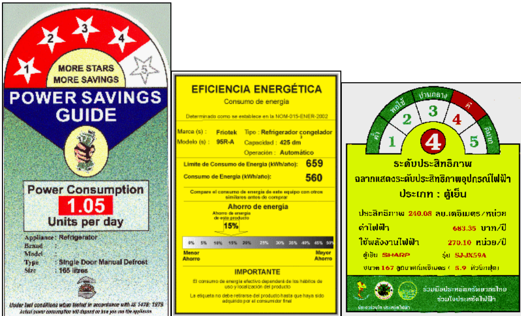
Figure 5-1 Refrigerator Efficiency Labels – (left to right) India, Mexico, Thailand

Once a testing procedure is decided upon, the next component addressed is often the process of designing a label. As in the case of energy levels, it might be easier for the implementing government to adopt the same design as another country. In fact, several countries have very similar designs for some products. In general, however, countries developing programs design their own label in a way that is highly customized to their own consumers. Below are Label designs for refrigerators for India, Mexico, and Thailand.