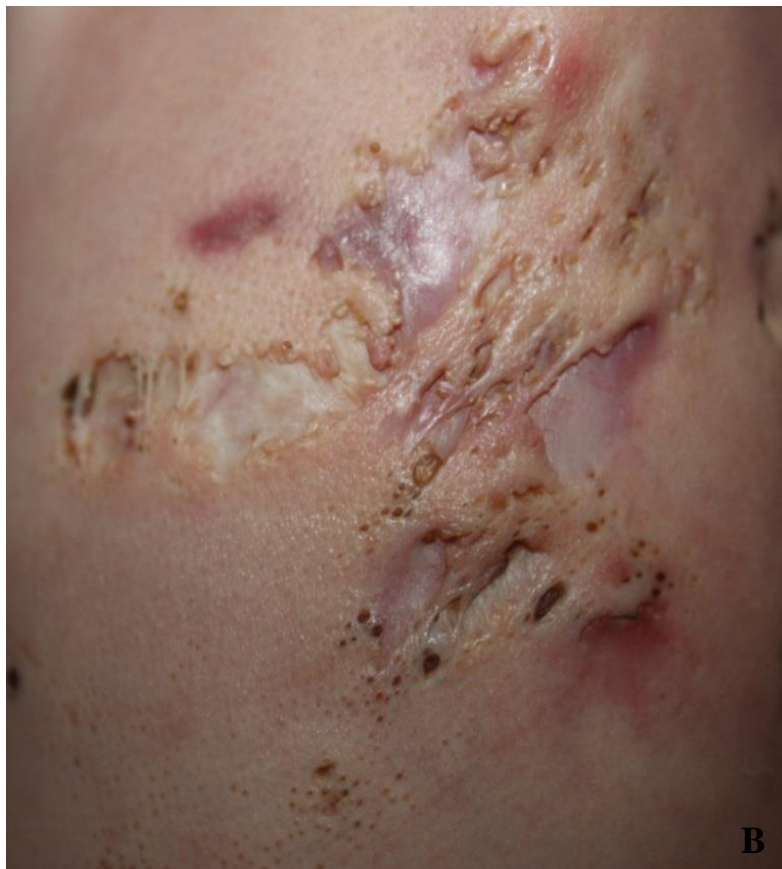
Figure 1. A) Multiple nodulocystic lesions, atrophic scars, fibrous tracts and grouped comedo-like pits scattered on the left side of the trunk, superior limb and the retro-auricular area, B) Close-up of the lesions on the left back

The first lesions were noticed on the left periareolar area. These progressively enlarged during the recent years and multiple similar lesions developed on the left side of the neck, trunk, arm, forearm, left buttock, and retro-auricular left area as well as right parietal region. Family history was negative, no present or history of systemic involvement was noticed since birth.