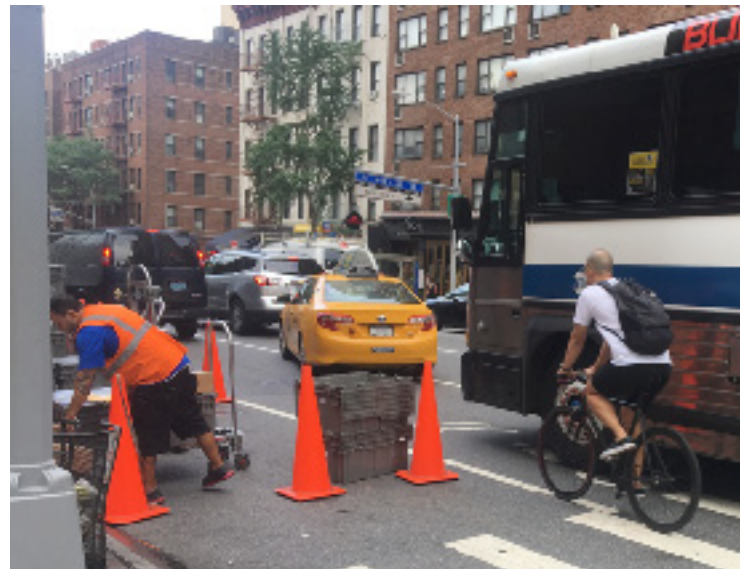
Figure 1. A cyclist navigates along a sharrow in New York City.

our study, some physically protected paths lacked any injuries at all," Wall and his research team wrote. "Their designs and use may be informative to improve bicycle route infrastructure in other locations where injury risk and severity are greater than expected." In other words, cities should look at where injuries haven't occurred to prevent where they do.