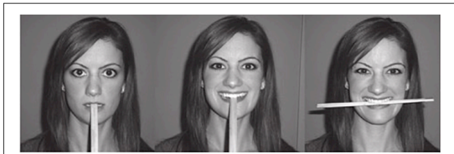
FIGURE 1 | Chopsticks have been used in past literature in order to induce neutral facial expressions ( left panel ), non-Duchenne smiles ( center panel ), and Duchenne smiles ( right panel ). This figure adopted from Kraft and Pressman (2012).