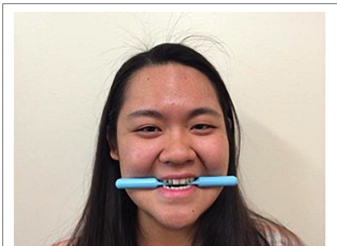
FIGURE 4 | The example photograph of the Smile Stick that was shown to all participants (written informed consent was obtained from this individual for the publication of this image).

hold (them/the device) in your mouth tightly. Make sure that your teeth are showing at all times. Be sure to mimic the facial actions exactly as they are shown in the picture.” For the device-free smile manipulation, participants were shown a photograph of someone displaying a Duchenne smile (see Figure 5 ). Participants received the following instructions: “For this final task, please smile naturally like the person in the picture. Please smile as big as you can and as sincerely as possible.” During the training periods for each manipulation, research assistants ensured that the participant’s teeth were showing and that their eye and cheek muscles were activated. Participants were corrected during the training period as necessary, but were not corrected during the 1 min data collection periods. Participants held each expression for 1 min while EMG was continuously assessed. After each manipulation, participants completed self-report measures of comfort, difficulty, and muscle fatigue and how positive, negative, and aroused they felt. Participants then moved on immediately to the training for the next manipulation. After all three manipulations were finished, participants were debriefed about the study.