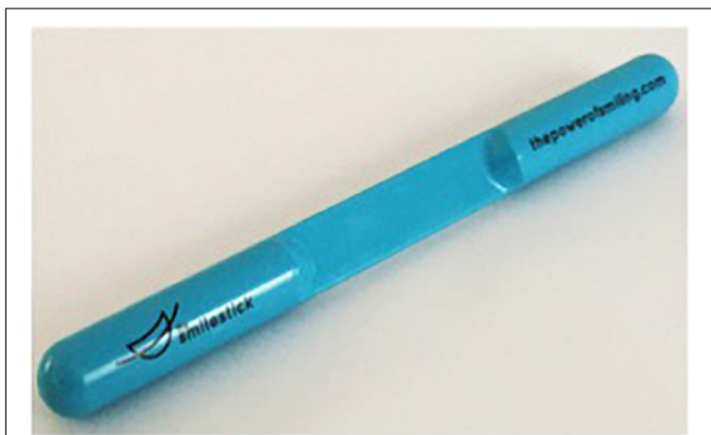
FIGURE 2 | A Smile Stick.

as well as easily sanitized. Beyond comfort, this device may have the benefit of seeming more professional and hygienic in a research setting (since it is a medical device) as compared to other tools used in past research like pens and chopsticks that were not designed for this purpose, may not be easily sanitized, and may even have unanticipated problems like giving splinters (wooden chopsticks), being slippery to hold (plastic chopsticks), or leaking (pens). We test whether this new device is comparable to the past utilized chopsticks/pen approach as well as how it compares to device-free smiles. Importantly, should the Smile Stick be effective, future smile manipulation studies could use this more environmentally friendly and cost effective approach, as researchers would need only a few Smile Sticks that they could appropriately sterilize and reuse rather than purchase brand new pens or chopsticks for each participant in the study.