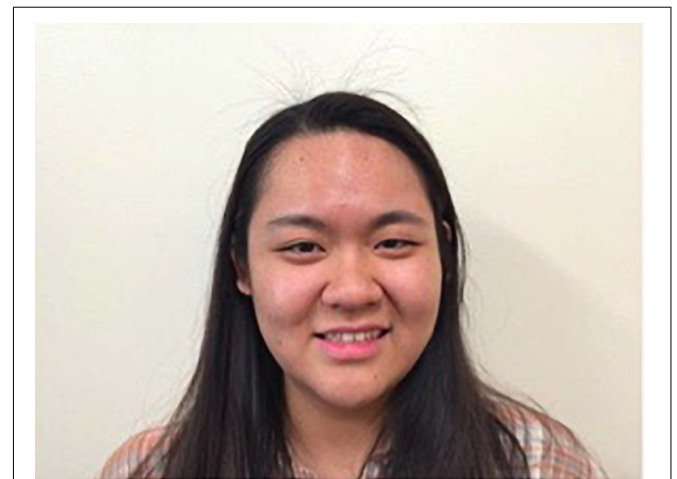
FIGURE 5 | The example photograph of a device-free smile that was shown to all participants (written informed consent was obtained from this individual for the publication of this image).

Immediately following each manipulation, participants were asked seven questions, each rated on a scale of 0–100. Participants were asked to rate their experiences with each of the three device positions on muscle fatigue (“How tired are your facial muscles?”), difficulty (“How difficult was it to hold the facial device like this?”), and comfort (“How comfortable was it to hold the facial device in this way?”). One question was aimed at determining how aroused participants felt [“How aroused/activated (i.e., energetic and aroused) do you feel right now?”], and one was aimed at determining how unaroused participants felt (“How unaroused/unactivated (i.e., tired and low energy) do you