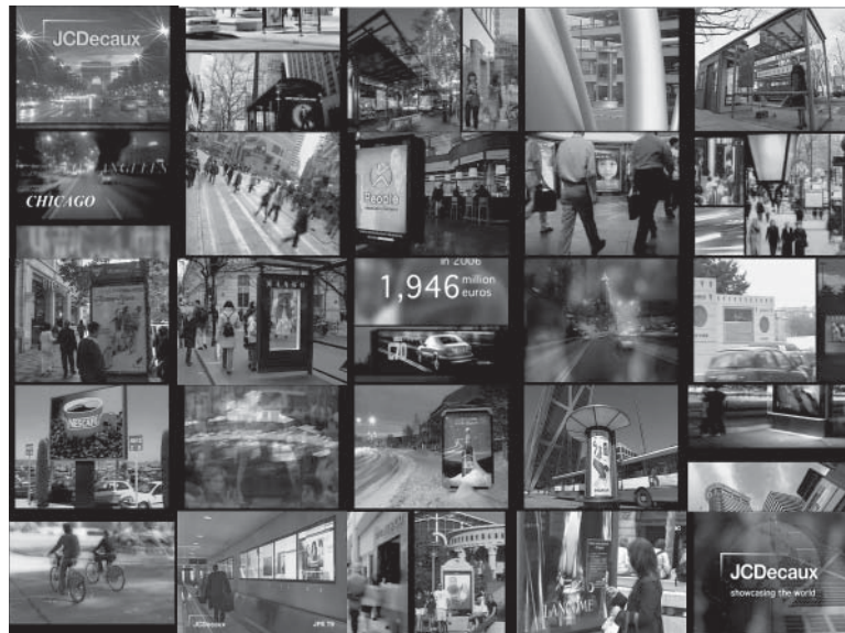
Figure 1. Clipped images from JCDecaux Japan website video

Jean Claude Decaux's claim to inventing street furniture is not his to make. What did happen in 1964 is that he lobbied the French government to allow his company to install bus shelters across France. He provides bus shelters as a "public service amenity" in return for control of their integrated advertising panels. As such, the JCDecaux brand has transcended into an indicator of globalization in both the "space of place" and the "space of flows." The company's ubiquity both mimics and drives the growing reach of a globalized cultural economy, in which corporate advertising imagery becomes the backdrop of urban life. Decaux's true contribution—a model of public-private partnership which calculates the demand of corporate advertising into accounting for transit service – is now part of decision-making processes which determine the level of service in neighborhoods around the globe.