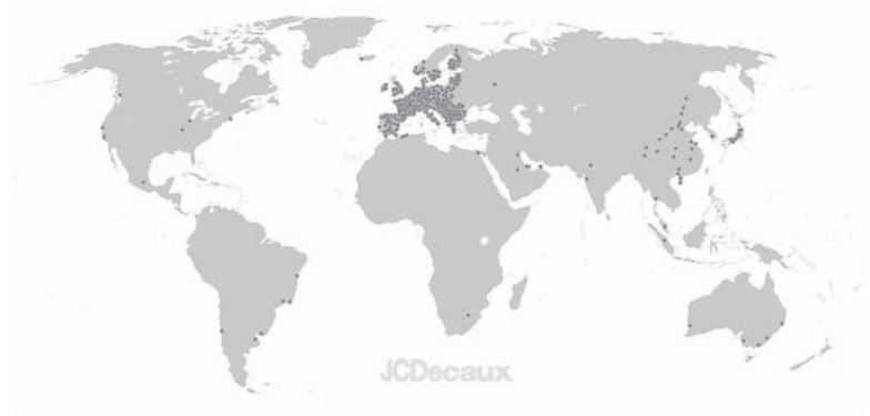
Figure 3. Author’s global map of JCDecaux contract cities based on information from JCDecaux websites.

While most of the holdings are held by a group of companies under the JCDecaux corporation, this fragmentation of legal corporate ownership does not extend to its corporate branding policy: the “JCDecaux” name is the most pervasive element of the business, emblazoned on every object it places in the public and not-so-public realms (Figure 3).