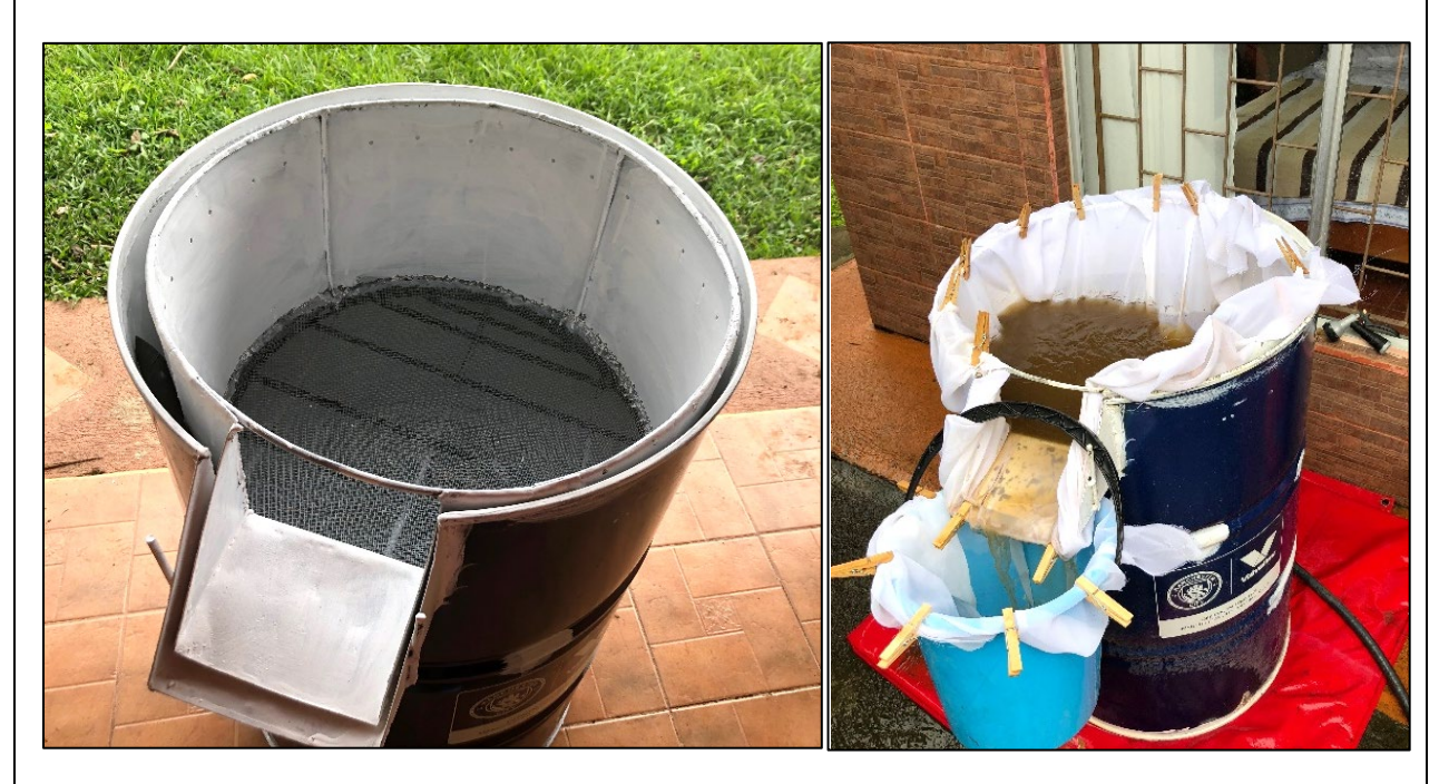
Figure 1. The SMAP-style flotation tank constructed to process soil samples at G-995 La Chiripa.

To gather data, I constructed a machine assisted flotation system that used pressurized water flow (tap pressure) to agitate the soil matrix within water. This machine was a SMAP-style water flotation tank (Figure 1) and allows for a detailed recovery of any organic materials preserved below the surface. Water flows continuously into the 55-gallon tank via a hose connected to a water tap. The water exits directly beneath the heavy fraction basket, which was lined with a mesh screen. Water exits the tank as overflow into a light fraction bucket, whose bottom is also lined with mesh screen material. Because a mesh screen fine enough for a detailed recovery was not obtainable in Tilaran, mesh cloth (0.2 mm opening) was placed both in the light fraction collection bucket and the inner basket of the tank for the heavy fraction. Any organic material within the soil samples placed into the inner basket will float up to the surface and exit the top opening and will be collected in the mesh fabric lining the light fraction bucket.