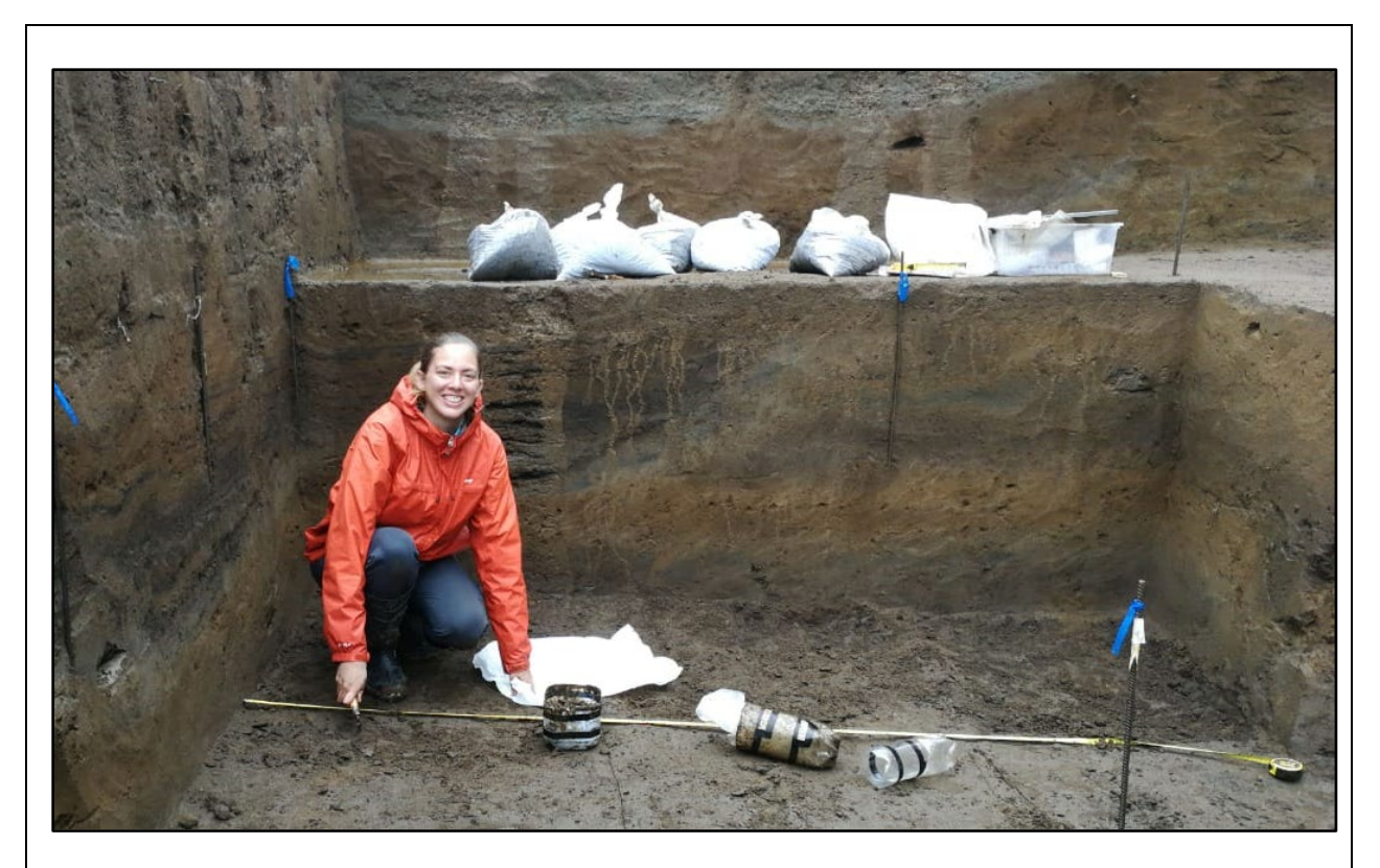
Figure 2 . Image of author collecting samples designated for flotation from each square meter of UN 60 using a trowel, brush, and plastic bottles for the measurement of sample volume.

samples had 100 poppy seeds ( Papaver somniferum ) added before being processed with flotation, in order to test the recovery rate of the flotation process. The results of this recovery test are not yet calculated.