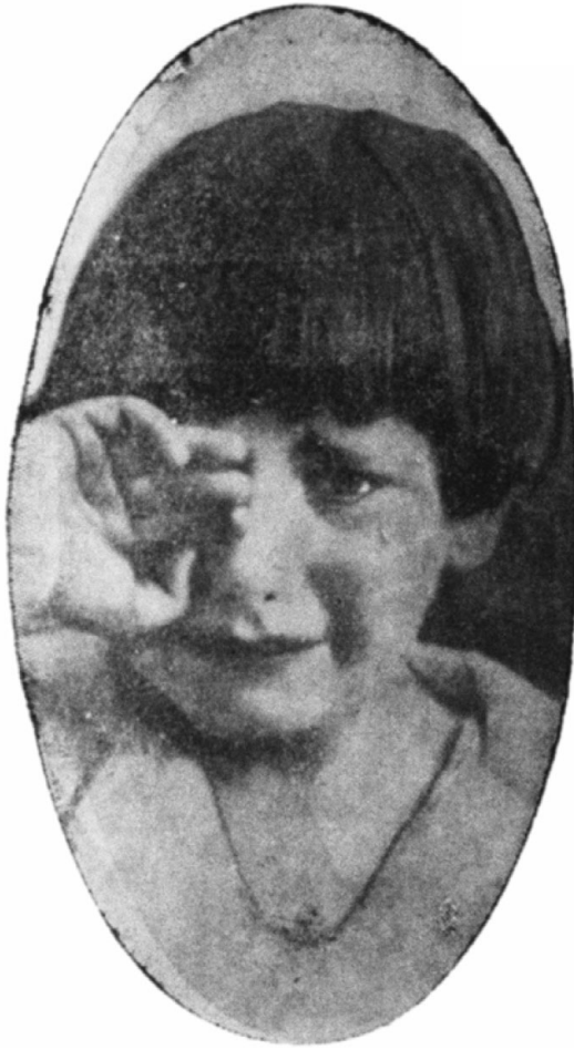
FIGURE 3. Crying Boy, 1927.

intensive grooming for national service confirmed expectations that theirs would be a lifetime of public and patriotic work.