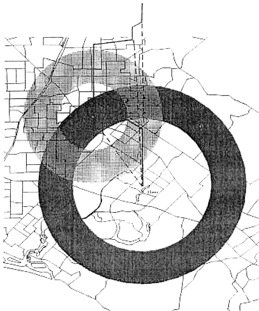
Figure 2 Simulation of Activity Destination