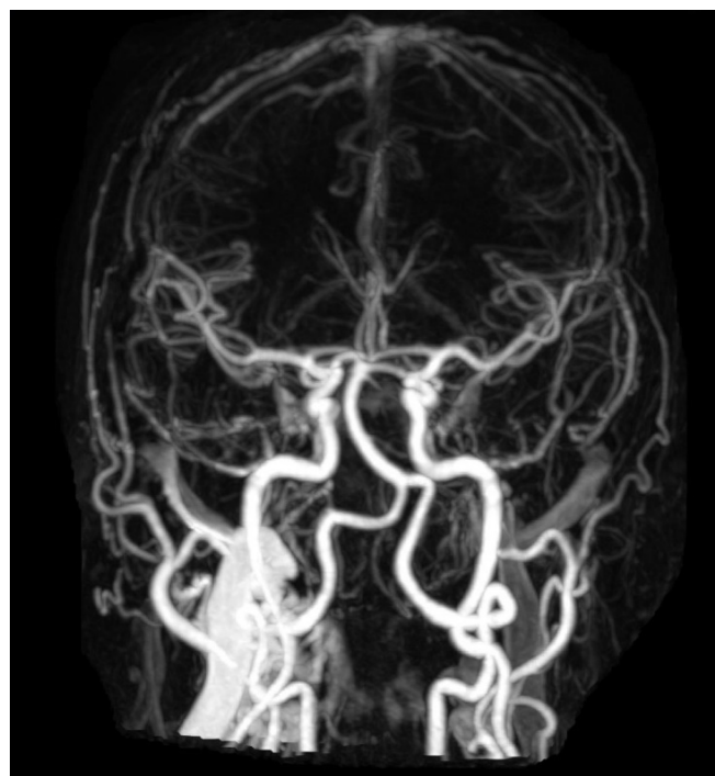
Figure 1. Brain MRI and MRA report and image.

Imaging revealed a right-sided AV dural fistula with predominant contribution through the right external carotid artery branches. There is no acute infarction, intracranial hemorrhage or intracranial mass. No evidence of significant segmental stenosis or aneurysm involving the proximal intracranial arteries. No evidence of segmental stenosis or dissection. (See Figure 1.)