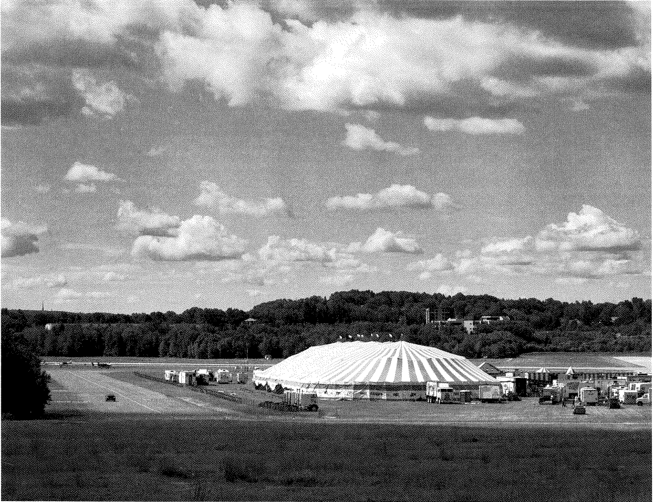
Fitchburg Municipal Aripport, April 1998