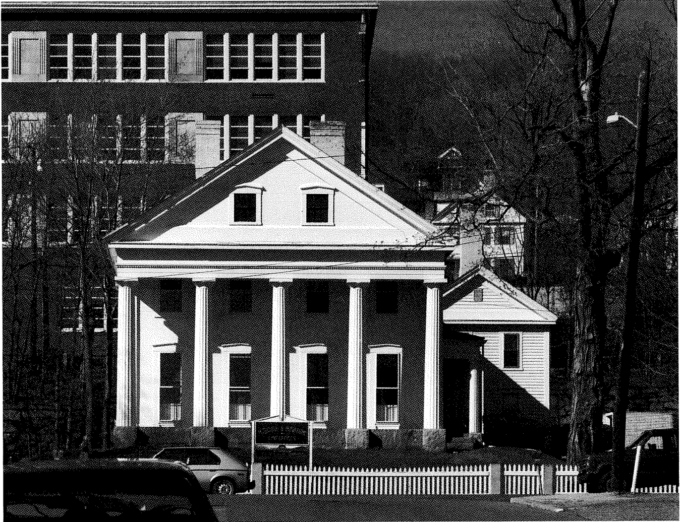
Law offices and high school, May 1996