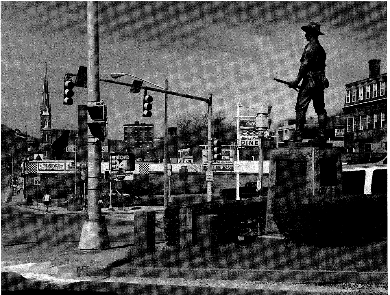
Moran Square, April 1996