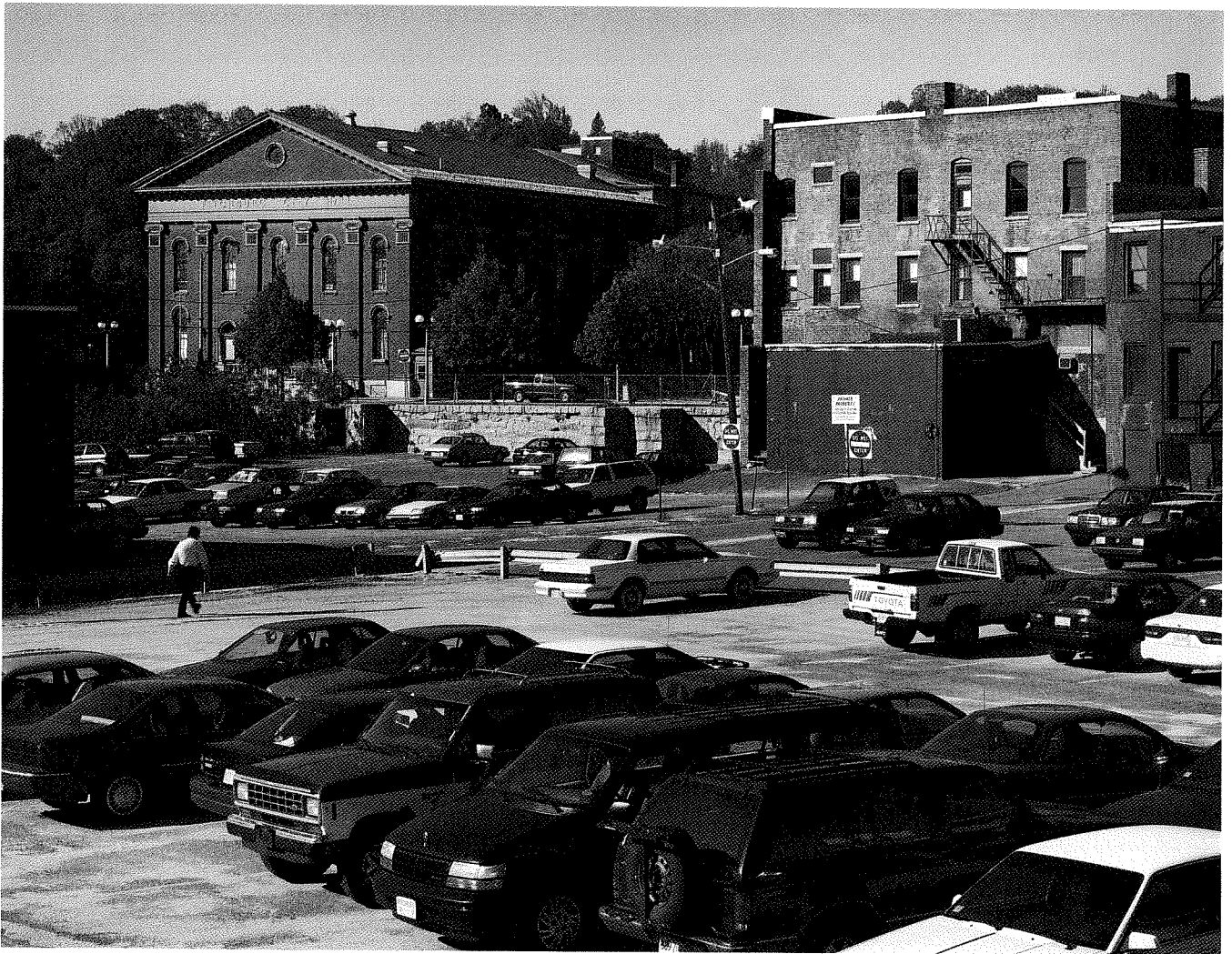
City Hall, May 1996