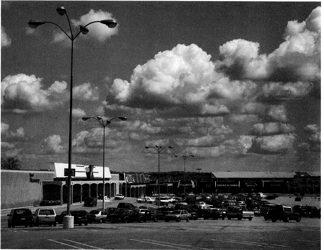
Twin Cities Plaza, May 1996