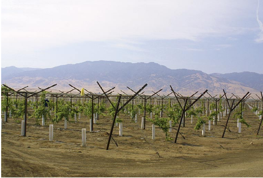
Boron deficiencies are common in the old flood plains and alluvial fans of California's Central Valley. Above, a newly planted table grape vineyard.

grapevines are susceptible to temporary boron deficiency of developing tissues during periods of drought, suggesting limited boron mobility.