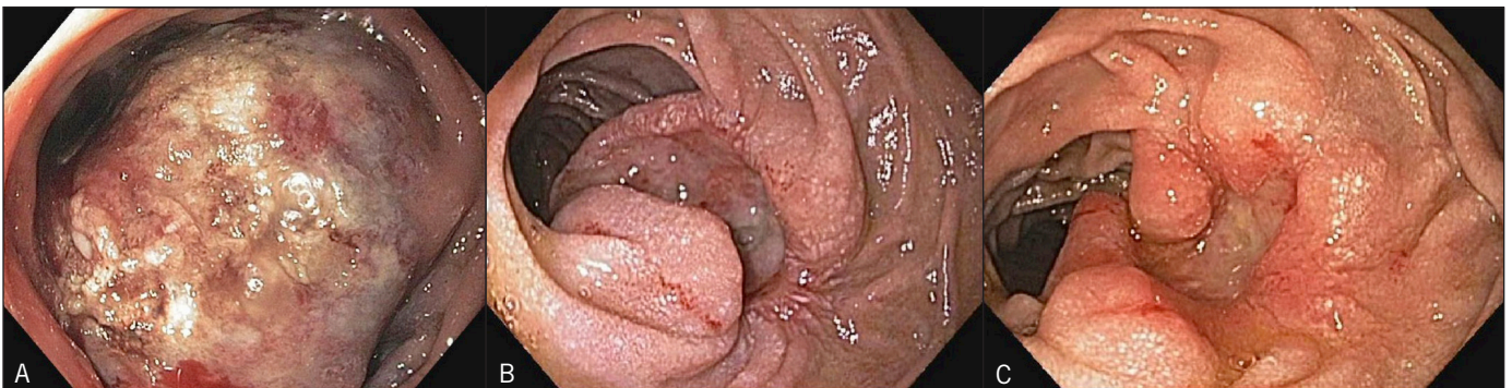
Figure 3. Obstructive lesion (A) after initial ethanol injection, (B) 6 weeks after initial injection, and (C) 25 weeks after the initial injection, during which time 3 additional injections were administered.