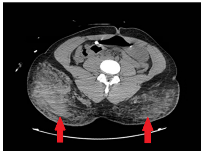
Image 2. Computed tomography of the abdomen and pelvis with contrast demonstrating opacities in gluteal subcutaneous fat, suggestive of inflammation from silicone injections (arrows).

Chest radiograph obtained immediately after intubation demonstrated left-sided, ground-glass opacities. Computed tomography demonstrated extensive bilateral pulmonary airspace disease as well as opacities in the gluteal area suggestive of cosmetic injections, consistent with the physical exam (Images 1 and 2). A subsegmental pulmonary embolism was also present. Broad spectrum antibiotics were initiated due to concern for a surgical site infection, given subcutaneous emphysema also present on CT (Image 3). Blood gas results were notable for a lactic acidosis with a pH of 7.24 (reference range 7.35–7.45). A decreased ratio of arterial oxygen partial pressure to fractional inspired oxygen