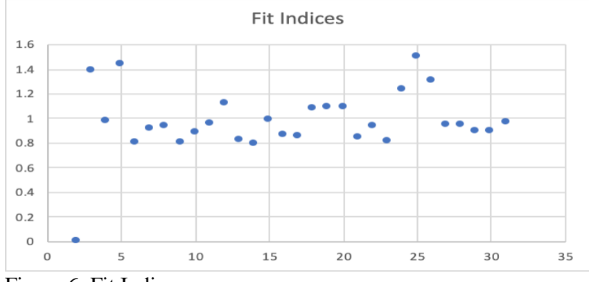
Figure 6. Fit Indices