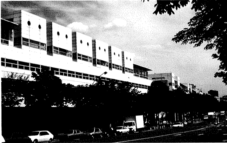
Hôtel industriel le Dorian. Design by KLN Architecture.

tions to facilitate development, and it took an active role in helping developers secure tenants. While developers selected their own architects in early projects, later projects have most often been awarded to joint-venture teams through architectural competitions. This process has resulted in both architecture and urban design of high quality; some projects have been designed by internationally known architects like Renzo Piano, Paul Chemetov and Dominique Perrault.