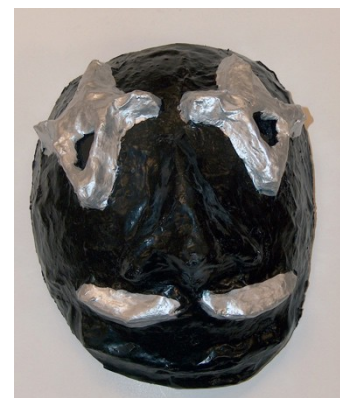
Figure 1. Four photographs included in Jenny’s “Indiana Jones” Documentation

Post Activity Reflection: In retrospect, I wish I would have limited the number of masks we analyzed. I felt like they could have gotten deeper descriptions in