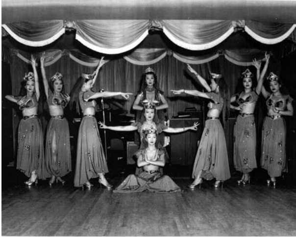
Figure 2. Chorus girls and showgirls of the China Doll Nightclub, New York City, 1946–1947.

the following acts: “Chinese Beauty Chorus”; “10 Oriental Swingsters”; “Gay 90s Sextette.” Also featured are: “Toy and Wing, 4 Kim-Loo Sisters, Ming and Chan, Joe Wong-Lai-Tel, Shanghai Wing Troupe.” Altogether the advertisement boasts a cast of “40 Chinese Artists.” A picture of Toy and Wing in a ballroom dance pose is beside a photo of the Shanghai Wing Troupe in a lineup with one preteen girl, three women, and five men, all in silken tops and pants. As was common at the time, the stage show was accompanied by a movie screening—in this case the film When G-Men Step In (“Chinese Follies” 1938). It appears from the advertisement and reviews I have collected that the “Chinese Follies” toured at least three times: 1938, 1943, and 1946. I have discovered ads and reviews documenting the show’s runs in Cedar Rapids, Seattle, and Reno.