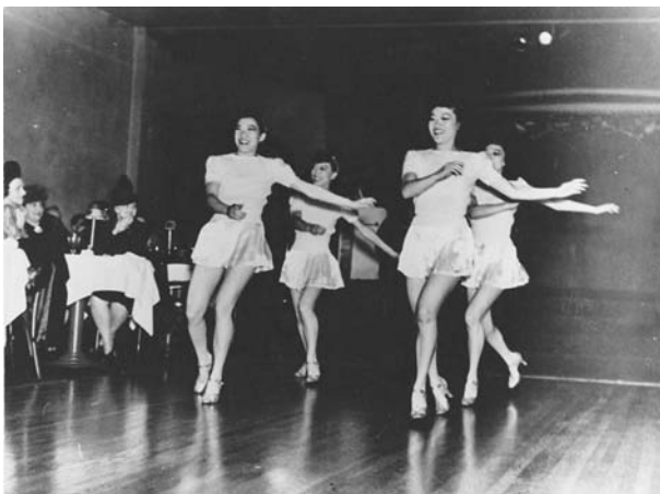
Figure 1. Forbidden City Chorus [1940s/'50s?].