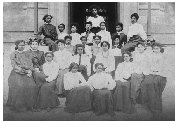
Armstrong Manual Training School, Washington, D.C., 1908

The prohibitive cost of private training was a barrier for Black and working-class women who wanted to become kindergarten teachers. Limited access to training also hindered the ability of Black communities to build the teacher workforce necessary for expanding early education services. By 1898, 19 states contributed public funds to establish courses on kindergarten in state-run teacher training schools, referred to as Normal schools. However, even when publicly funded, Normal schools were typically segregated, denying access to Black women.