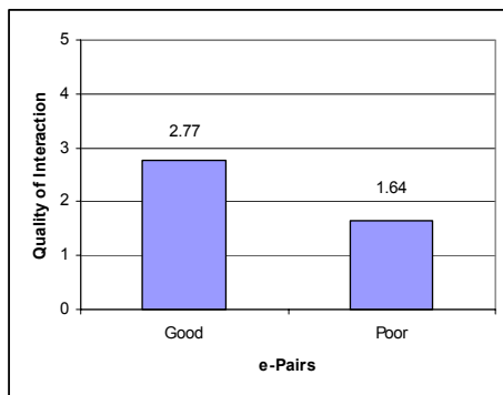
Figure 3. Quality of regulative interaction in general

Then, the hypothesis that high e-Pairs will be better in comprehension monitoring was tested. There were no significant differences at all three inconsistent sentences, although the pattern looks similar to that of the comparison between the e-Pairs and Singles.