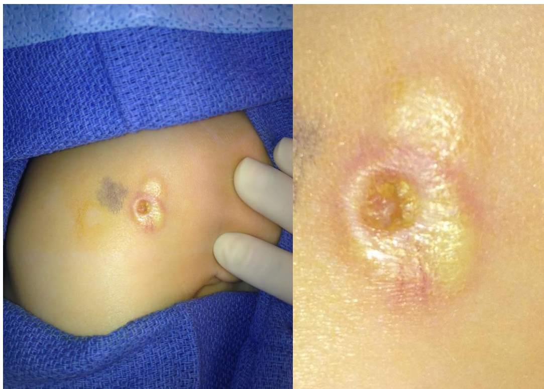
Figure 1B. The same lesion at the time of excision under general anesthesia. The nodule and surrounding skin had been treated with betadine. Applying tension to the surrounding skin revealed the bulky nature of the lesion. Figure 1C. Close-up view of (B).

Histopathologic analysis of the biopsy specimen revealed a proliferation of small spindle cells with scant eosinophilic cytoplasm and tapering nuclei within myxoid and hyalinized stroma. In some fields, small, whorled nodules of plump eosinophilic spindle cells with chondromyxoid and hyalinized changes were present. The proliferation occupied the entire dermis, was not encapsulated, and infiltrated into the superficial adipose tissue. There were no foci of necrosis or vascular invasion present. Immunohistochemical stains showed that lesional cells were positive for smooth muscle actin (SMA) and vimentin, and negative for S100, Factor XIIIa, epithelial membrane antigen (EMA), and desmin. CD34 highlighted vasculature, but was negative in tumor cells. These morphologic and immunophenotypic features were consistent with an infantile myofibroma