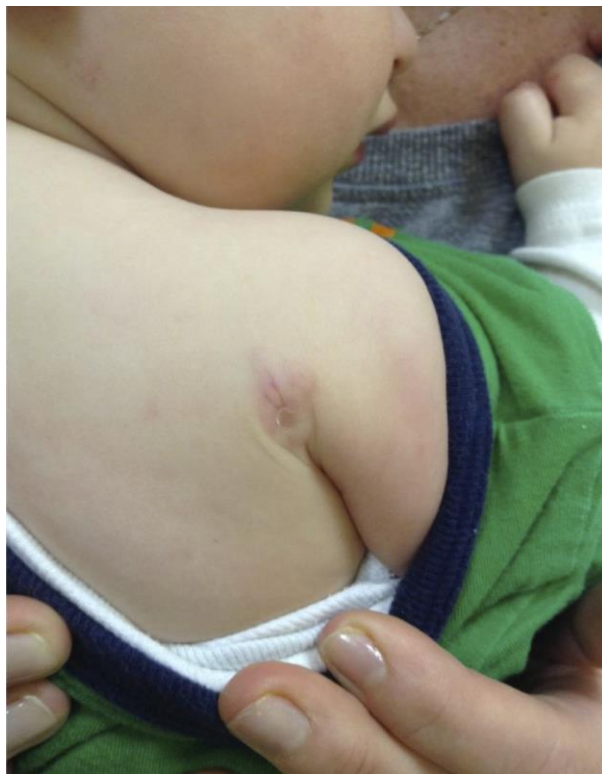
Figure 1A. A well-demarcated, round, firm nodule with telangiectasia and a central depression located on the patient's posterior shoulder.