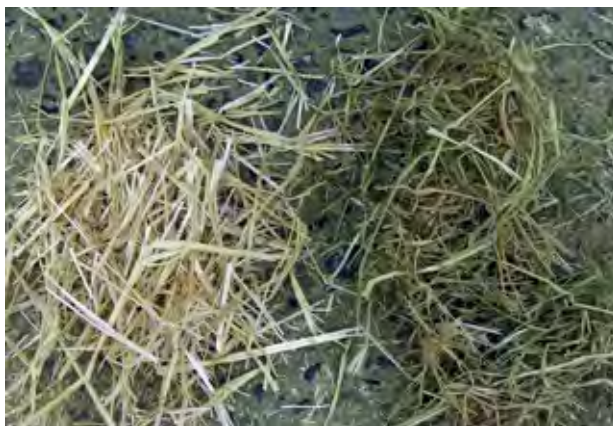
Figure 1. The traditional straw used in dairy heifer rations, wheat straw (left), is shown alongside cutter-baled rice straw (right).

Recent increases in feed costs have prompted dairy owners and nutritionists to explore new ways to optimize rations for growing heifers. In free-choice rations, dairy operators often use forages and wheat straw to provide bulk and limit feed intake. The use of rice straw, produced in high quantities in the Sacramento and northern San Joaquin Valleys, has been part of our research on dairy heifer rations since 2004. In our studies we have learned a lot about how to make rice straw a valuable feed in heifer rations as well as ways to overcome the main hurdle that has made it hard to use: incorporation of long rice straw stems into Total Mixed Ration (TMR) mixers requires substantially longer mixing times and often damages mixing equipment, necessitating shutdowns and repairs.