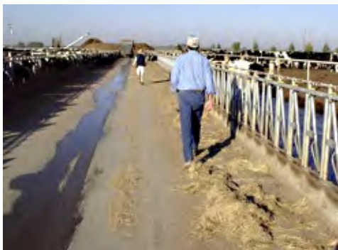
Figure 4. Flail-chopped rice straw in a TMR remains uneaten after 24 hours.