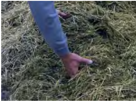
Figure 2. Cutter-baled rice straw that has been evenly mixed into the Total Mixed Ration (TMR).