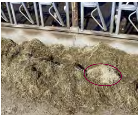
Figure 3. Flail-chopped rice straw causes uneven mixing.