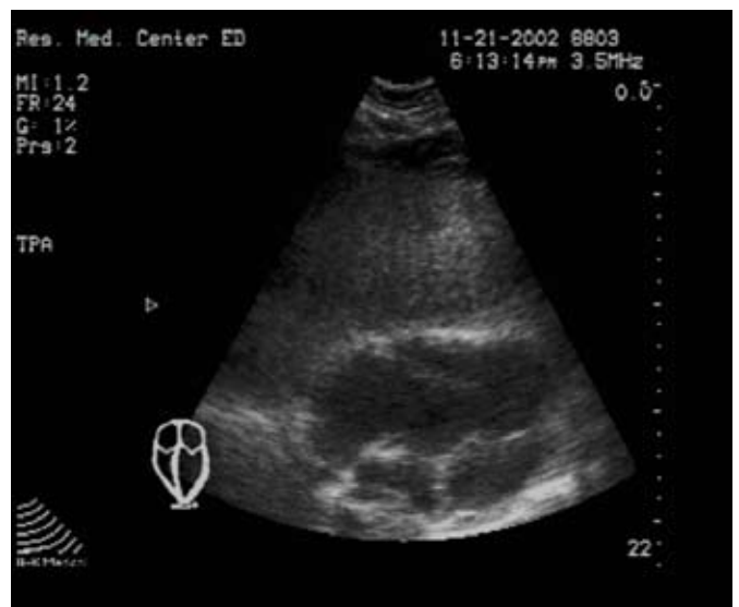
Figure 2. Apical four-chamber view taken at approximately 2 1/2 hours after cardiac arrest.