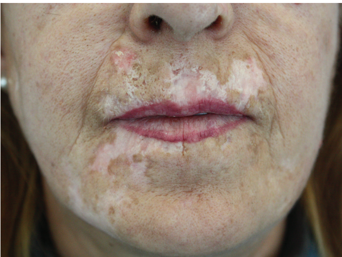
Figure 3. DLE three years after ustekinumab, in May 2015. Cicatricial plaques around the mouth with little active inflammation.

of poor results. Methotrexate associated with mycophenolate mophetil was not effective. In March 2012 ustekinumab was started. It was administered as 45 mg at weeks 0, 4, and then every 12 weeks, while she was still taking methotrexate.