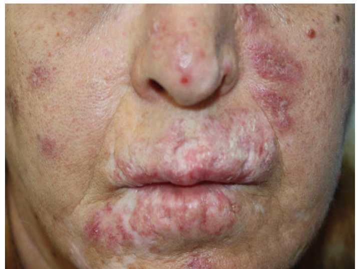
Figure 1. DLE before ustekinumab in March 2012: Erythematous and atrophic disfiguring plaques on the lips, chin, and left cheek.

had been used but were withdrawn owing to lack of response or side effects. Between 2004 and 2012, she received several additional treatments. Photodynamic therapy was stopped because of side effects after two sessions, without benefit [1]. Methylprednisolone boluses, methotrexate in combination with prednisone, neosidantoiné, and cyclosporine were all ineffective. In January 2009, efalizumab achieved complete control of the inflammation, but was stopped after market withdrawal in April 2009; inflammation of old plaques appeared a few days later. Again methotrexate, in combination with prednisone, acitretin, and thalidomidewereprescribed,withoutremarkableside effects but without complete control of the disease. A combination of mepacrine and methotrexate was also unsuccessful. Weekly rituximab 375mg/m 2 for a total of 6 weeks was stopped because