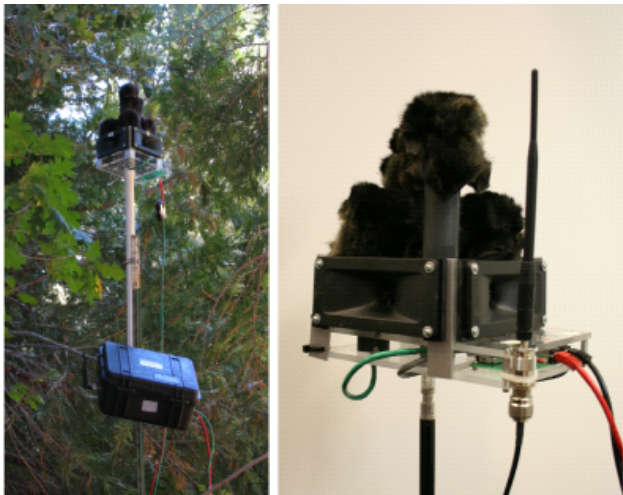
Figure 1: Left : Acoustic ENSBOX, the embedded device we used for our experiments. Right : close-up of the microphone array.

For our experiments we have developed a network of Acoustic Embedded Networked Sensing Boxes (Acoustic ENSBox) as a prototype for wildlife monitoring system [5, 6, 7]. Each system is a small embedded computer running Linux, self-contained in a waterproof case, with an external four microphone array and 802.11b wireless communication (Figure 1).