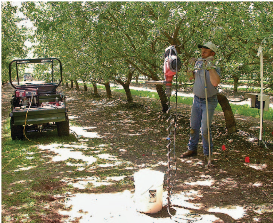
Microsprinklers are used in most almond orchards, allowing very precise measurements of how much water is being used by the trees. Above, Allan Fulton augured holes to install neutron-probe access tubes for monitoring stored soil moisture.

There is a pressing need to reliably maintain current almond production with less water. Surface-water