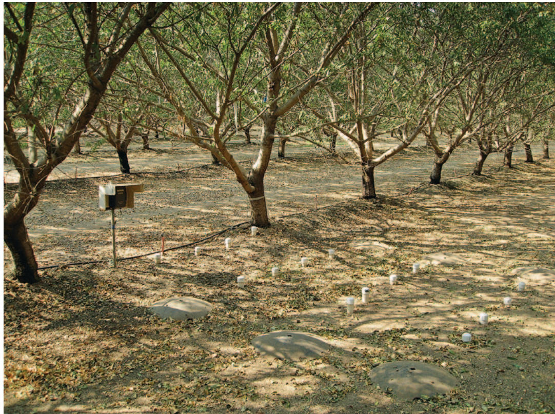
Grids of neutron-probe access tubes allowed the researchers to take soil moisture readings at different depths. They found a shallow water table that receded throughout the growing season, especially during two drought years.

In 2006, a separate irrigation system that could be monitored and controlled via a satellite-linked Internet service (Automata, www.automata-inc.com ) was installed for the experimental 'Nonpareil' row and the two adjacent