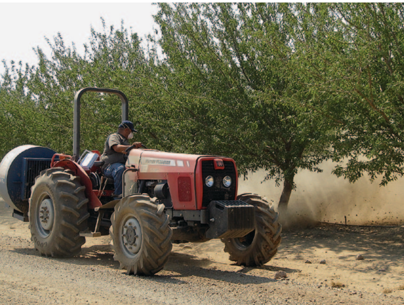
The study did not measure any almond yield reductions attributable to regulated deficit irrigation. Yields increased in both treatments due to the orchard's young age and ongoing canopy growth. Above, almonds are swept into windrows.

Although no significant reductions in overall yield or gallons of irrigation water used per pound of nutmeat were observed in our study, significant reductions in yield have been documented in previous deficit experiments with almonds. The negative effects in those studies were not extreme, and the yield reductions were generally associated more strongly with water deficits imposed during postharvest than during hull split. In a 4-year study by Girona et al. (2005), a statistically significant (20%) reduction in overall yield was associated with a 40% reduction in water application and a nonsignificant (3%) reduction in kernel dry mass. In our study, the overall treatment difference in kernel dry mass of 2.5% was