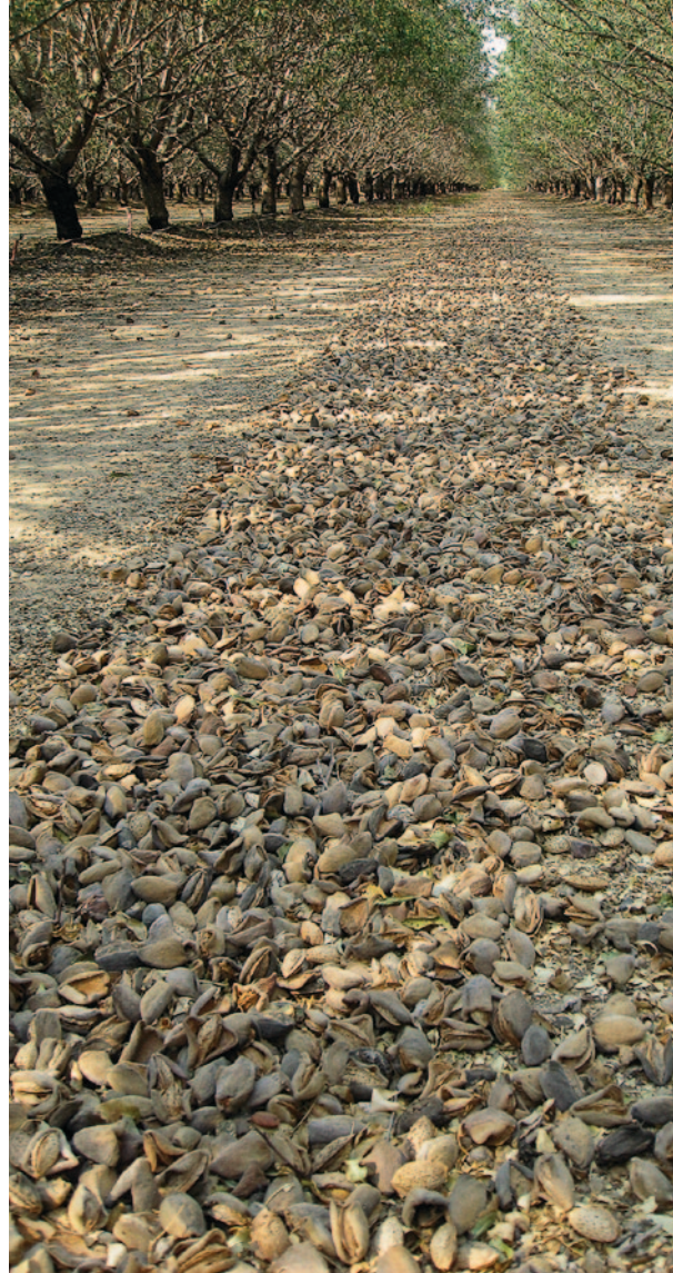
A plant-based strategy for monitoring tree water stress allows growers to target deficit irrigation during specific stages of the growing season, possibly resulting in significant water savings.

We acknowledge funding from a Proposition 50 grant administered by the California Department of Water Resources, Office of Water Use Efficiency and Transfers (Peter Brostrom, Project Officer).