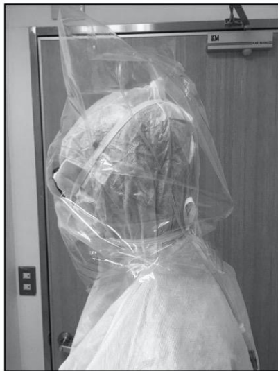
C. Secure the nasal cannula at the top of the bag from the inside.