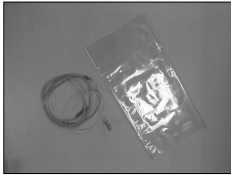
A. Materials: Highly transparent plastic bag at larger than 36 cm x 45 cm (width x depth) in size; nasal cannula tubing; medical air or O 2 source (not shown); and tape.