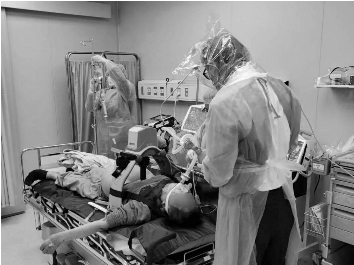
Figure 1. COVID-19 PEDS Head Isolation Unit in use during an Intubation in Taiwan during the COVID-19 Pandemic.

Note: The intubator is connected to an O 2 source and is wearing full facial PPE.