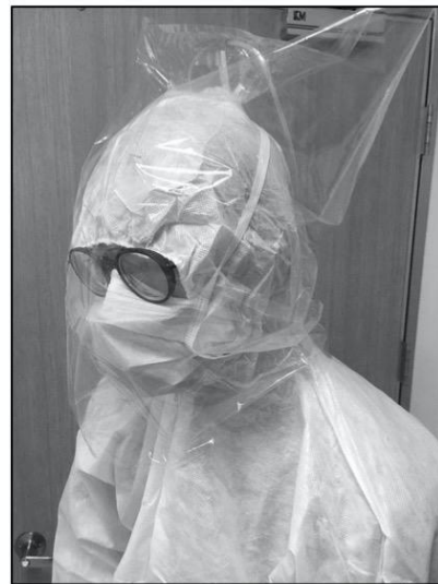
D. Have another person help don the unit (with air source already on) and secure the edges around the wearer's neck. Use the fit-testing procedure to ensure adequate protection.

Abbreviations: HCW, health care worker; PEDS, Positive-Pressure Environment Disposable Shield.