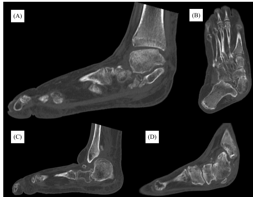
Figure 2. Computed tomography with (A,C,D) multiple sagittal cuts, and (B) a coronal cut after follow-up in orthopedic clinic demonstrating findings consistent with advanced stage Charcot joint with marked pes planus, mid-foot collapse, and hindfoot valgus.