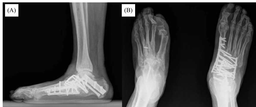
Figure 3. Most recent radiographs at final follow-up. (A) Lateral radiograph. (B) Bilateral anterior-posterior radiograph, revealing restoration of the arch of the foot, through the use of multiple osteotomy sites and internal fixation with a variety of plate, screw, and beam constructs.