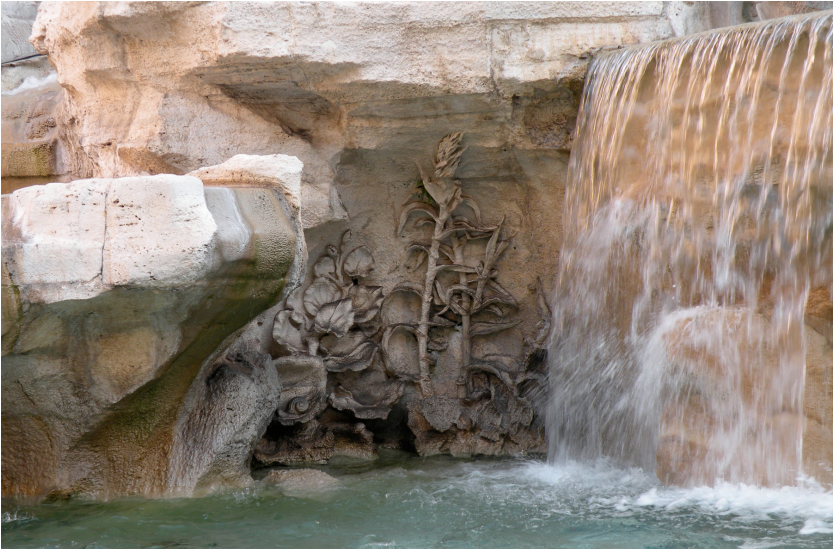
Figure 7: Carved water-loving plants, including Caltha palustris and Arundo donax , emerge from the Trevi basin.

all material things, and winding through the veins of Earth, even into the most minute recesses, reveals itself as the everlasting source of that infinite production which we see in Nature, which water also is capable of perpetuating.