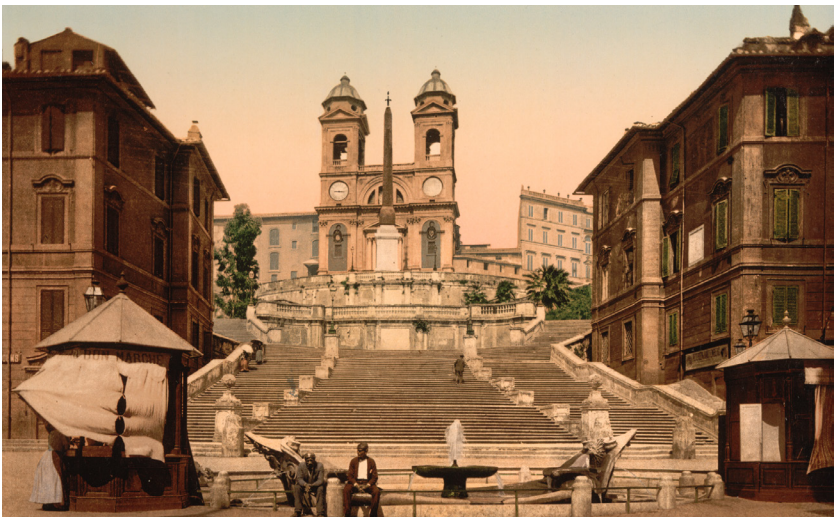
Figure 6: The Spanish Steps.