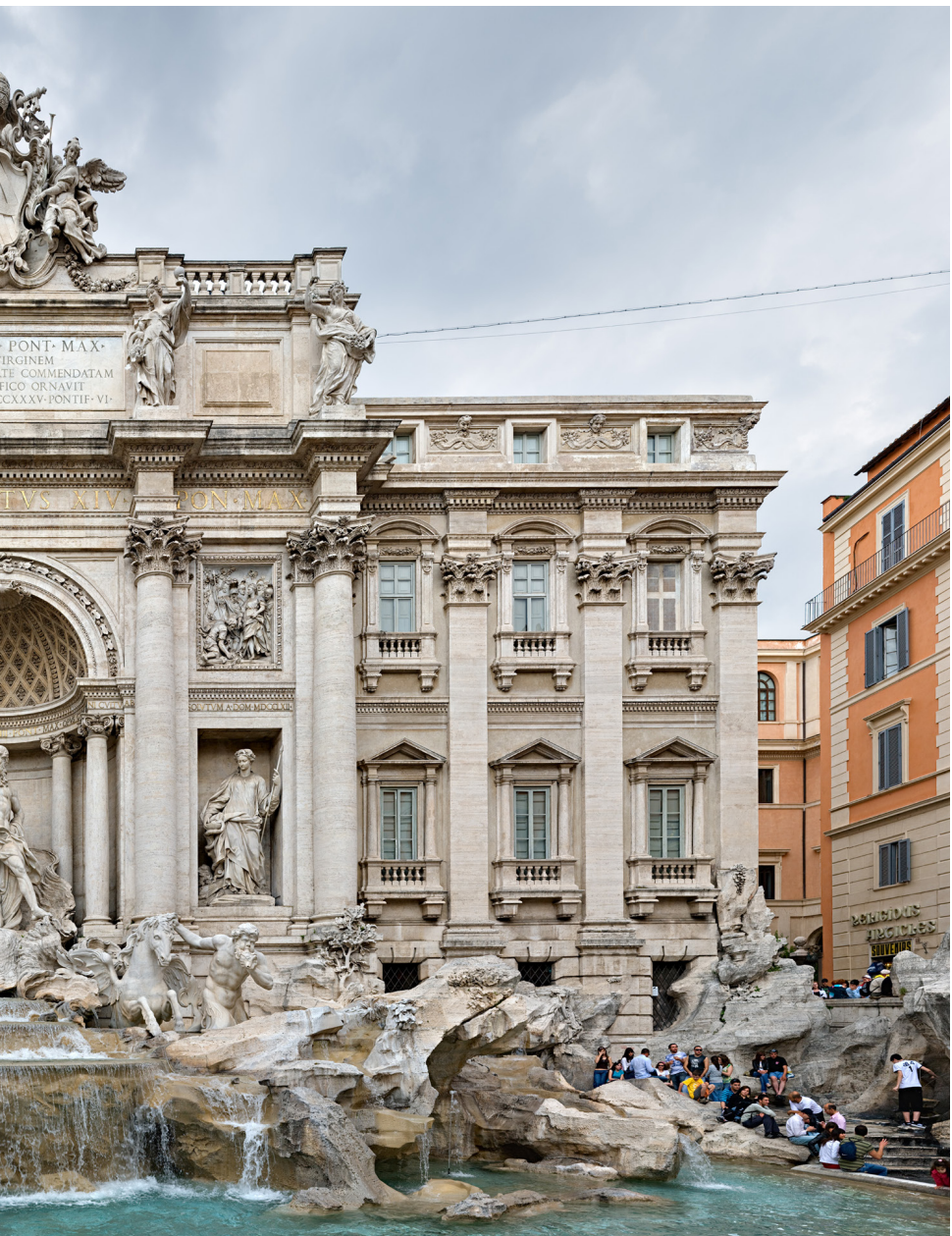
Figure 3: The Trevi Fountain, 2007. Photograph by David Iliff; License: CC-BY-SA 3.0.