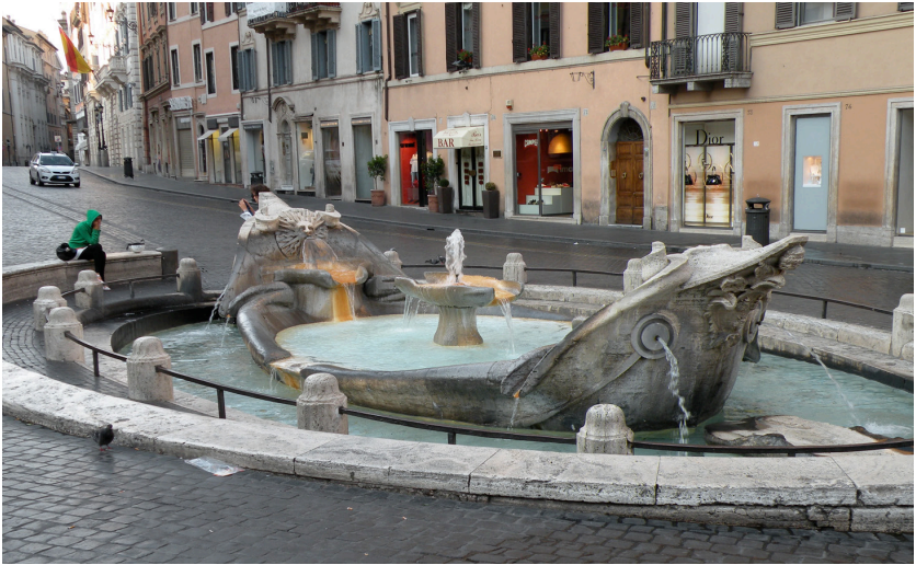
Figure 5: Even at 5:00am on a summer morning, the Barcaccia Fountain provides solace.