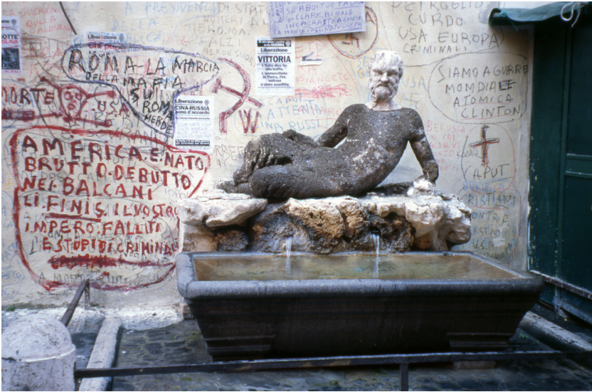
Figure 1: The Babuino, a public drinking fountain from the 1570s where Romans can still post anti-clerical and anti-government pasquinades .

water gushes into piazza fountains with reckless abandon, and bubbles from neighborhood taps in nearly every corner of the city. Little drinking fountains even take root like beneficent barnacles from palace and church walls. No facade is too aloof that it might not, someday, sometime, support its own little nymph or satyr spewing water into a sidewalk basin as an offering to any and all passersby (Figure 1). Rhapsodized by poets, tourists, and artists, the fountains are essential to Rome's identity and are part of the everyday environment of its citizens. What those of us from drought-plagued regions might see as an astounding luxury or extravagance, Romans see as a right of citizenship. Ever present and ever flowing, the fountains symbolize the abundant goodwill and generosity of the Romans themselves: to give water freely, to family, neighbors, and strangers alike, affirms a genuine openness of spirit.